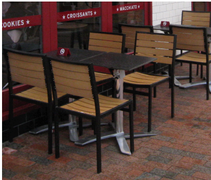
exterior chairs and tables:

note: external furniture to be brought into store outside of trading hours