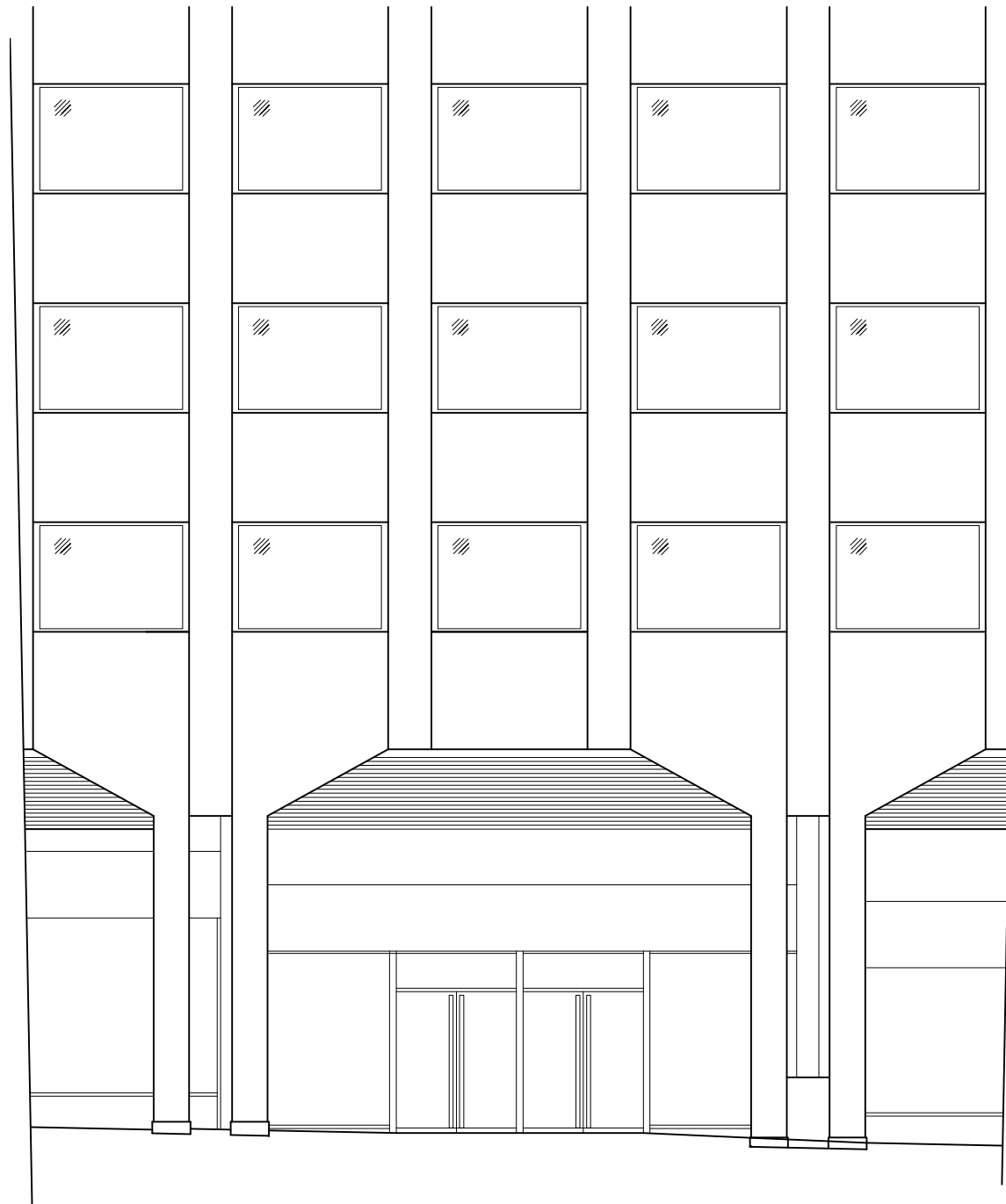
01 EXISTING FRONT ELEVATION P124846220 1:50@A1, 1:100@A3

Notes: Do not scale from this drawing. Contractors shall be responsible for the checking of all stated dimensions, with any anomalies being identified to the originator prior to any construction or fabrication works commencing.