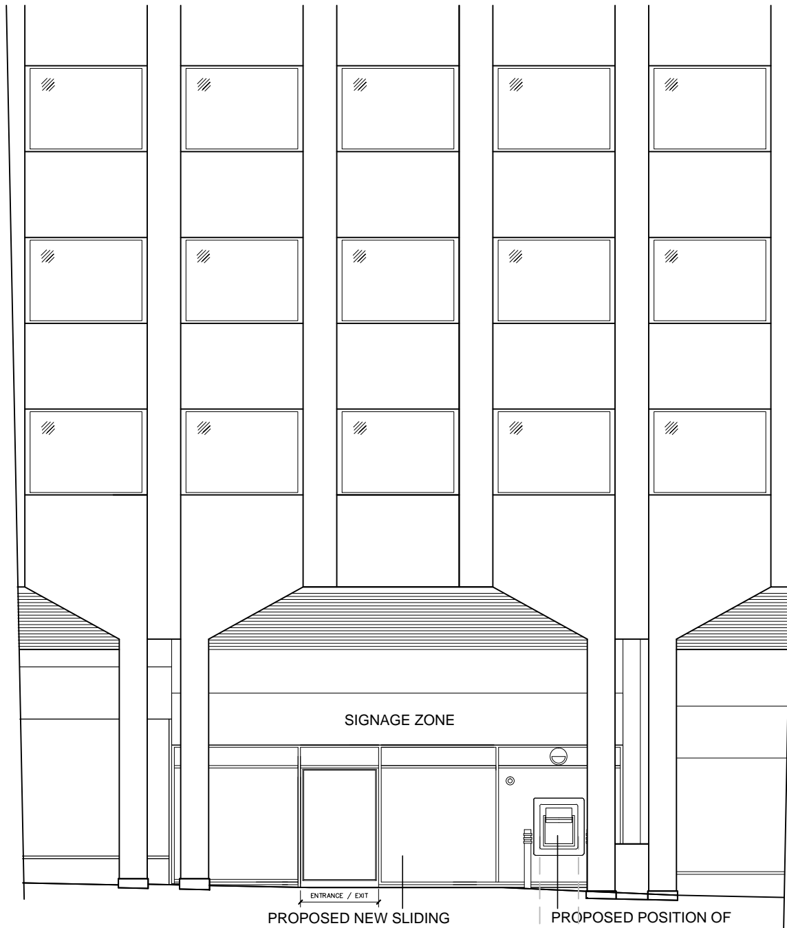
02 PROPOSED FRONT ELEVATION P124846220 1:50@A1, 1:100@A3

ENTRANCE / EXIT PROPOSED NEW SLIDING ALUMINIUM ENTRANCE DOOR AND SHOP FRONT GLAZING FINISH IN RAL 8019.