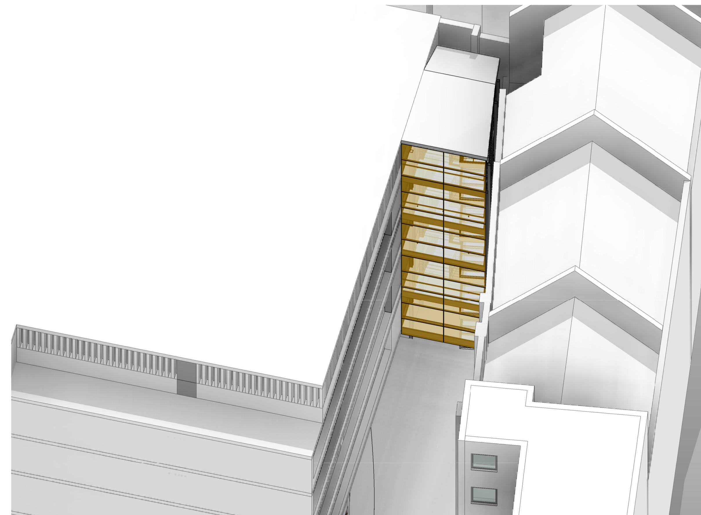
2 3D PERSPECTIVE 01

CLIENT STRUCTURAL ENGINEER SERVICES ENGINEER CONSULTANT