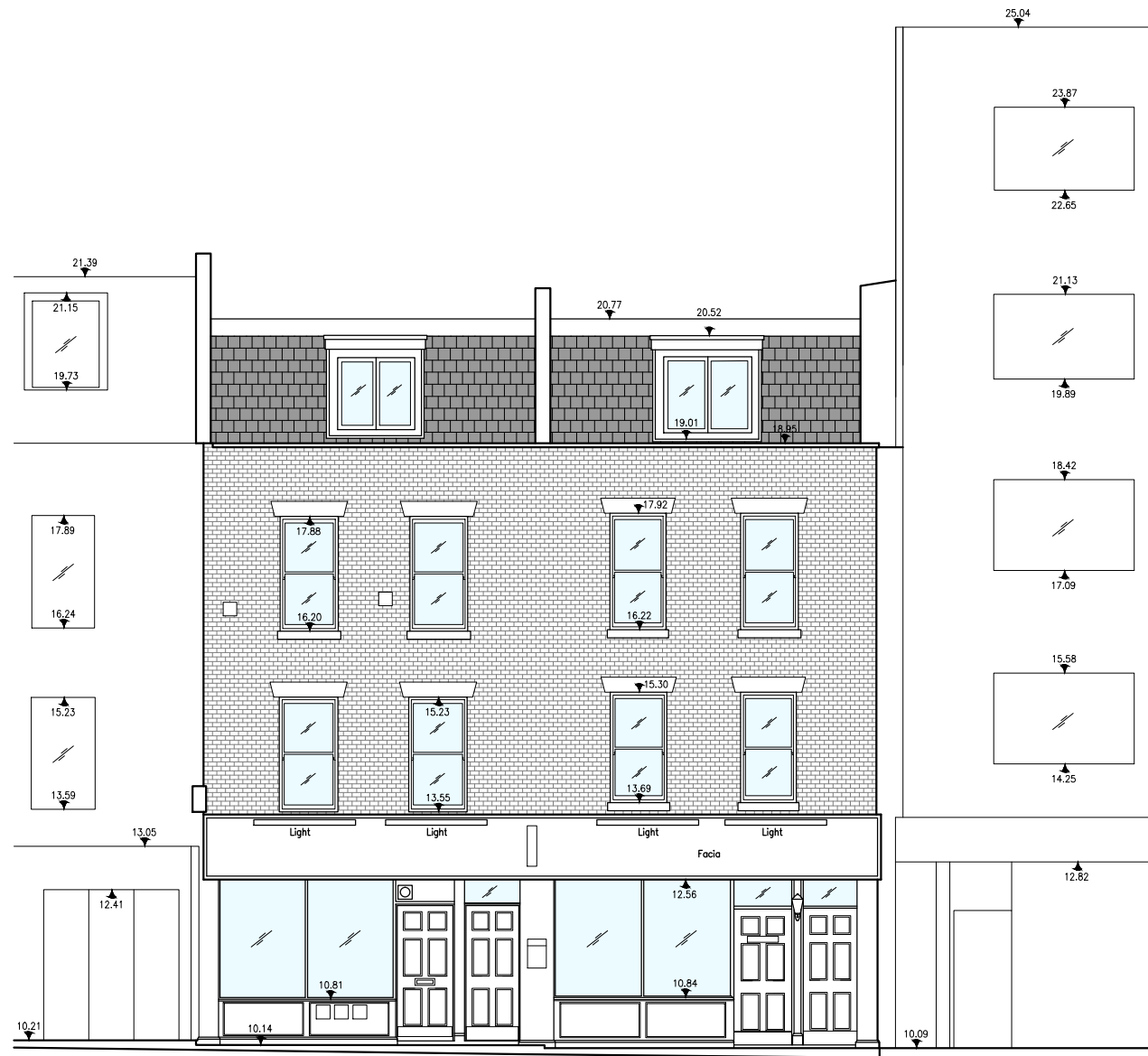
CHALTON STREET ELEVATION (FRONT)