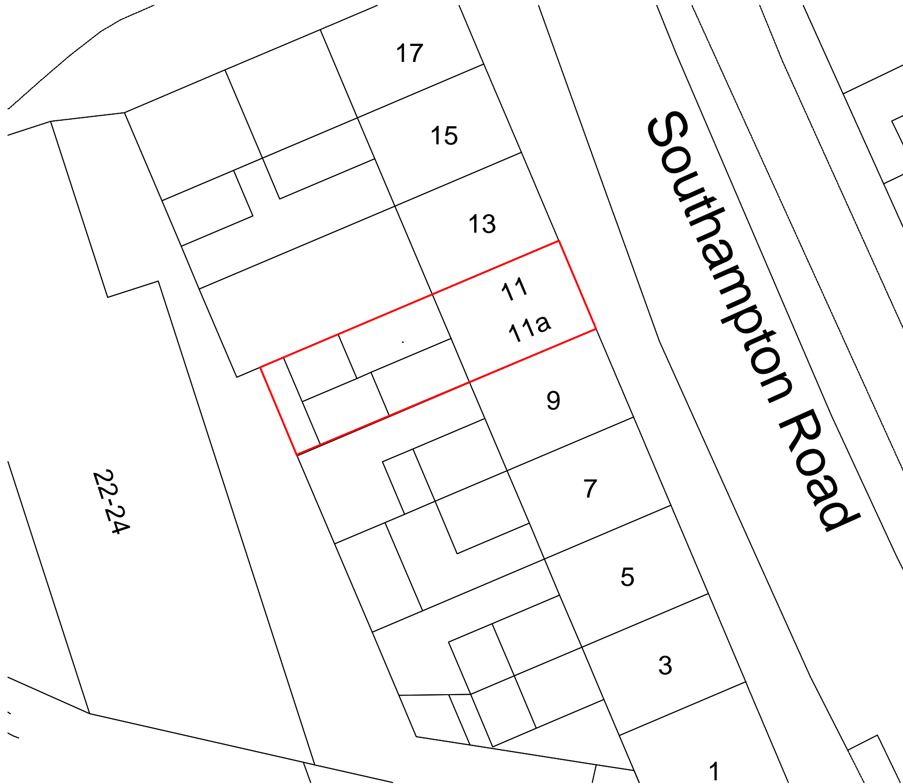
Site Plan - 1:200 @ A3