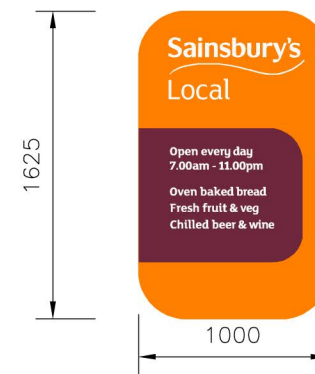
02 PROPOSED OFFER LOZENGE P124846230 1:50@A3, 1:25@A1