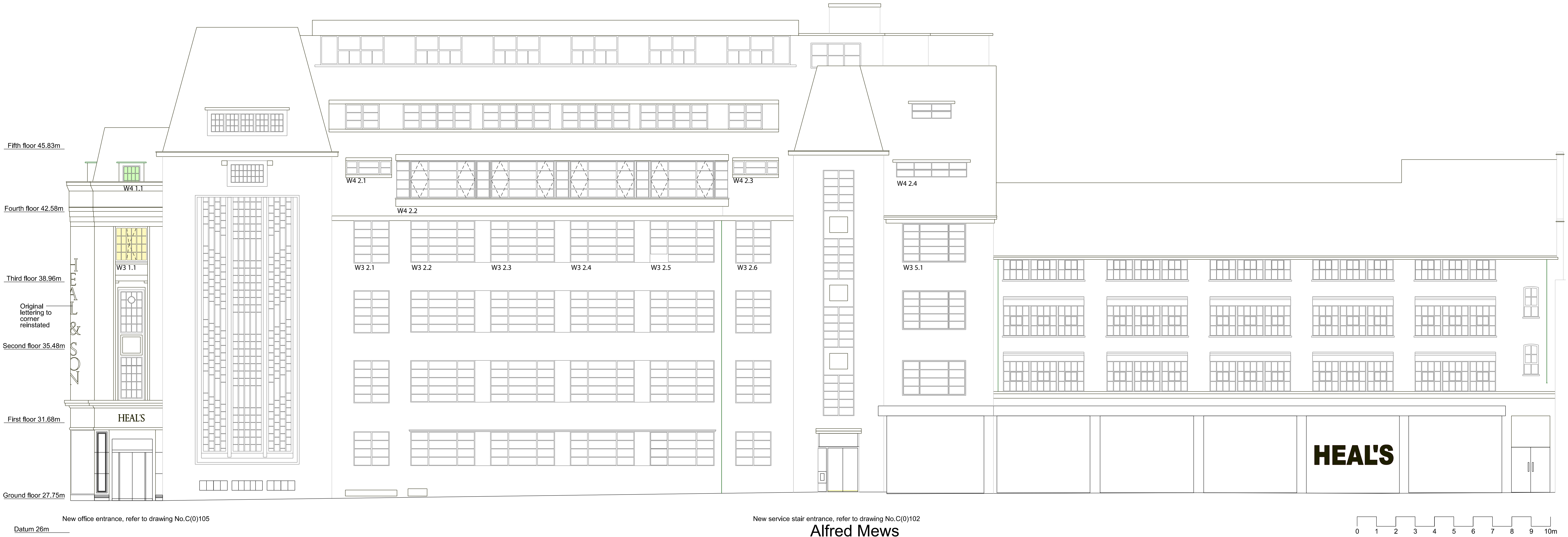
Section A - Alfred Mews Elevation