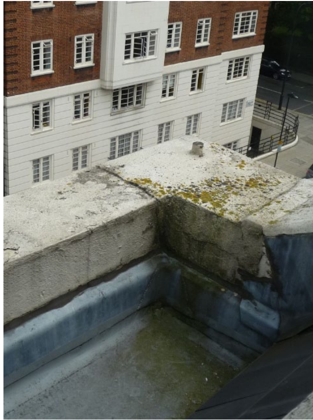
Photo 13: Endsleigh Annex front elevation: Metal balusters from previous guardrail are still evident.