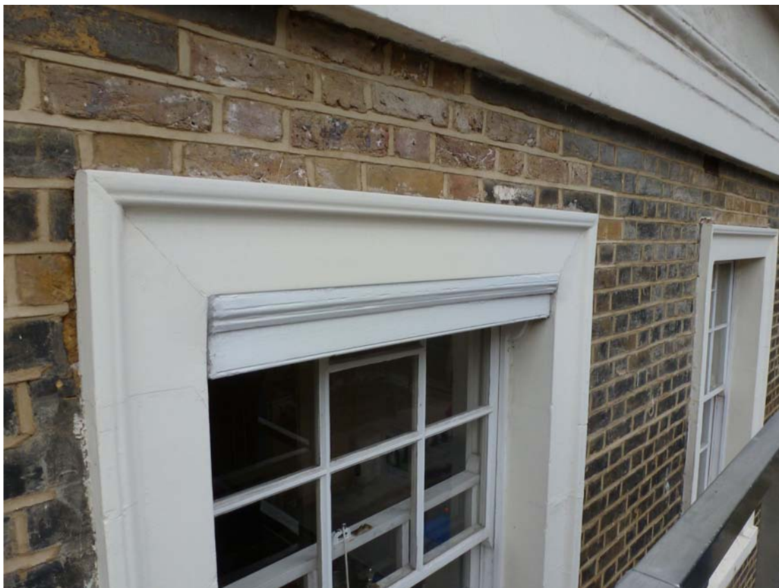
Photo 26: Taviton Annex - Non-original existing moulded window surrounds.