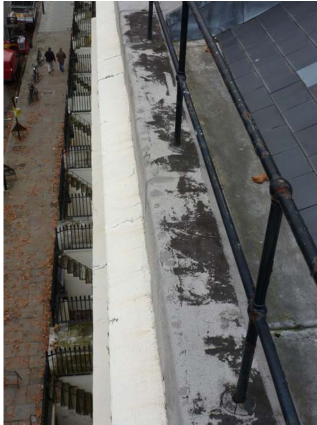
Photo 21: Taviton Annex - parapet and guardrail. (Guardrail to be removed).