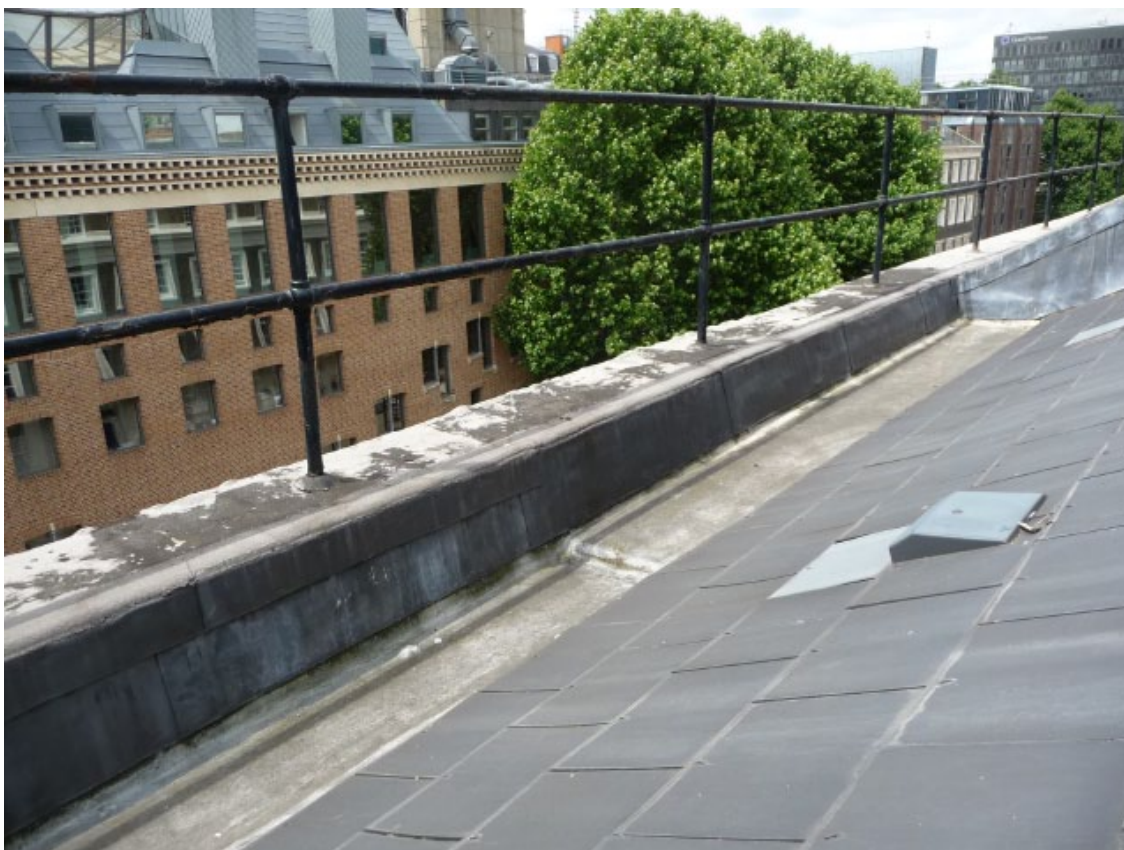
Photo 15: Taviton Annex: Existing guardrails to front elevation (to be removed).