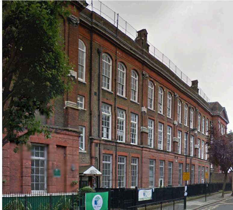
Extract from Google Streetview