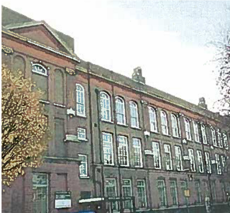
Extract from West Kentish Town Conservation Area Statement p12 (2005, Camden Council website).