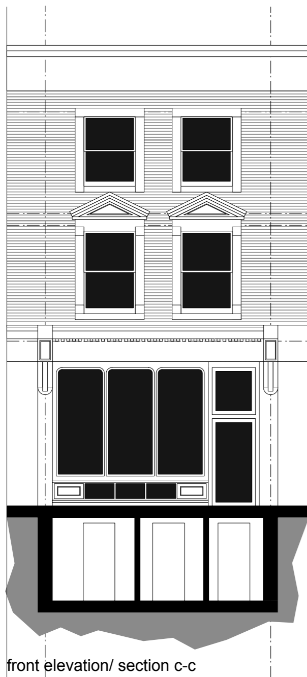
front elevation/ section c-c