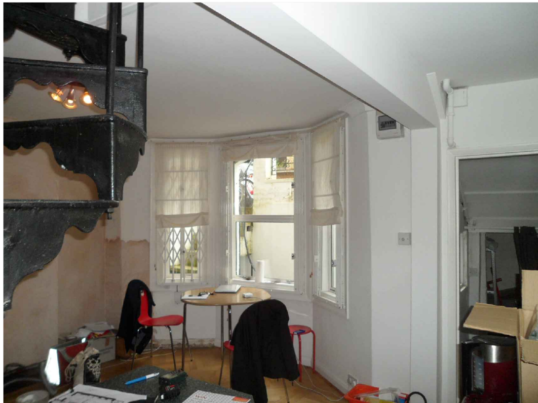
STANDING IN THE KITCHEN LOOKING TOWARDS THE LIVING ROOM