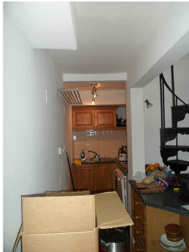
STANDING IN THE ENTRANCE HALL LOOKING TOWARDS THE KITCHEN