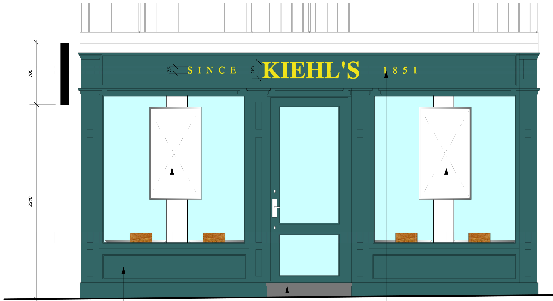
16 Existing Front Elevation.