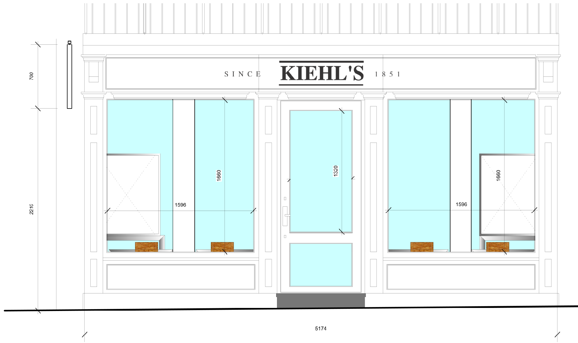
5 Existing Front Elevation.