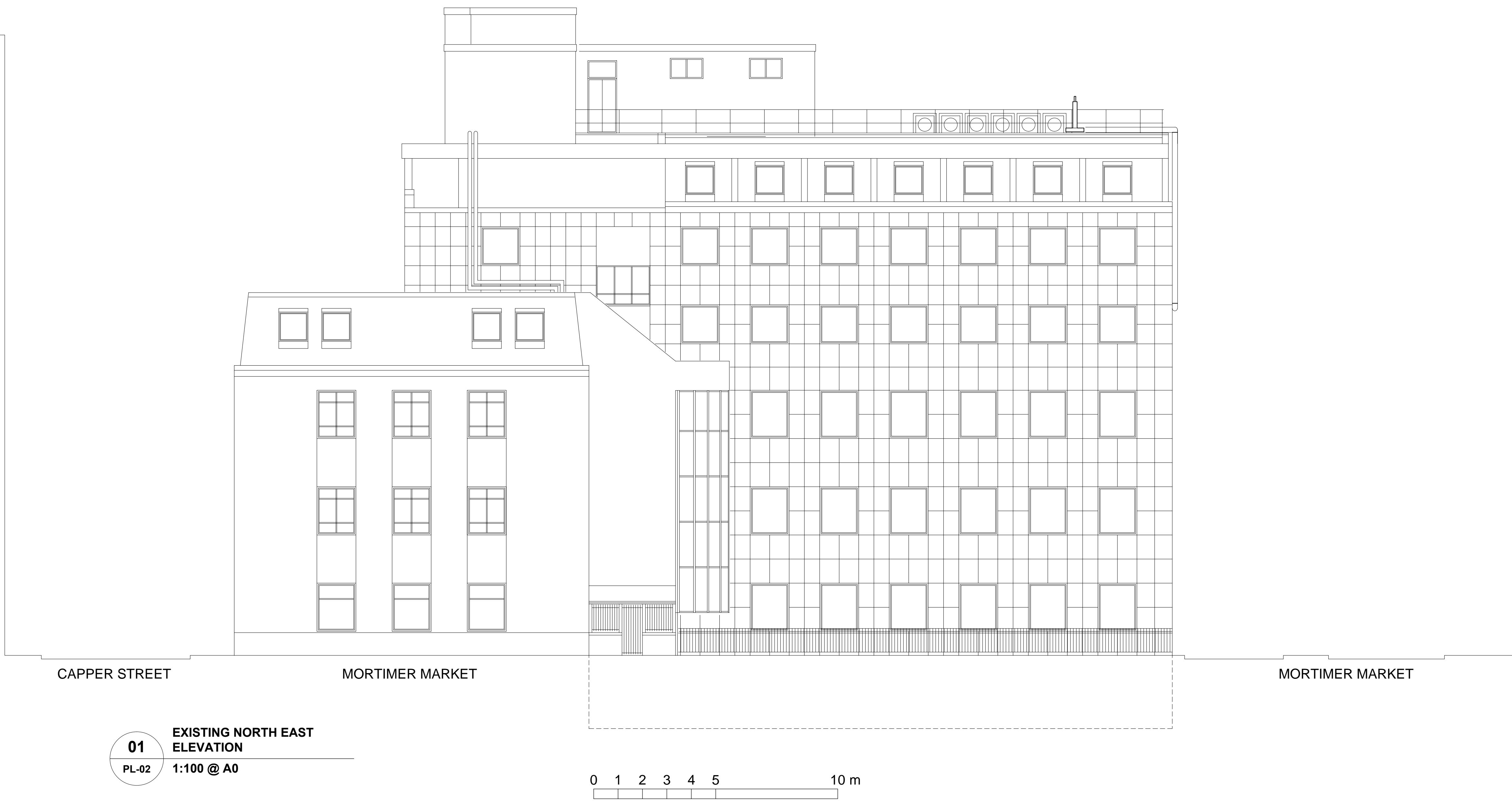
01 PL-02 EXISTING NORTH EAST ELEVATION 1:100 @ A0

THIS SCHEME IS SUBJECT TO TOWN PLANNING AND ALL OTHER NECESSARY CONSENTS. DIMENSIONS, AREAS AND LEVELS WHERE GIVEN ARE ONLY APPROXIMATE AND SUBJECT TO SITE SURVEY. ALL DIMENSIONS ARE TO BE CHECKED ON SITE. DO NOT SCALE. THIS DRAWING IS TO BE READ IN CONJUNCTION WITH ALL RELEVANT CONSULTANTS' AND/OR SPECIALISTS' DRAWINGS/DOCUMENTS AND ANY DISCREPANCIES OR VARIATIONS ARE TO BE NOTIFIED TO THE DESIGNER BEFORE THE AFFECTED WORK COMMENCES. ALL QUERIES RELATING TO DESIGN OF FOUNDATIONS, FLOOR SLABS AND ANY STRUCTURAL ELEMENTS ARE TO BE REFERRED TO THE STRUCTURAL ENGINEERING CONSULTANT FOR RESOLUTION. ALL FEASIBILITY STUDIES ARE SUBJECT TO FULL SITE SURVEY. THE WORKMANSHIP OF ALL RELEVANT TRADES AND BUILDING OPERATIONS SHALL COMPLY WITH THE RECOMMENDATIONS OF BRITISH STANDARD (BS) 8000:1989 PARTS 1-15 INCLUSIVE. ALL DESIGN AND CONSTRUCTION IS TO BE IN ACCORDANCE WITH THE CONSTRUCTION, DESIGN AND MANAGEMENT REGULATIONS 1994.