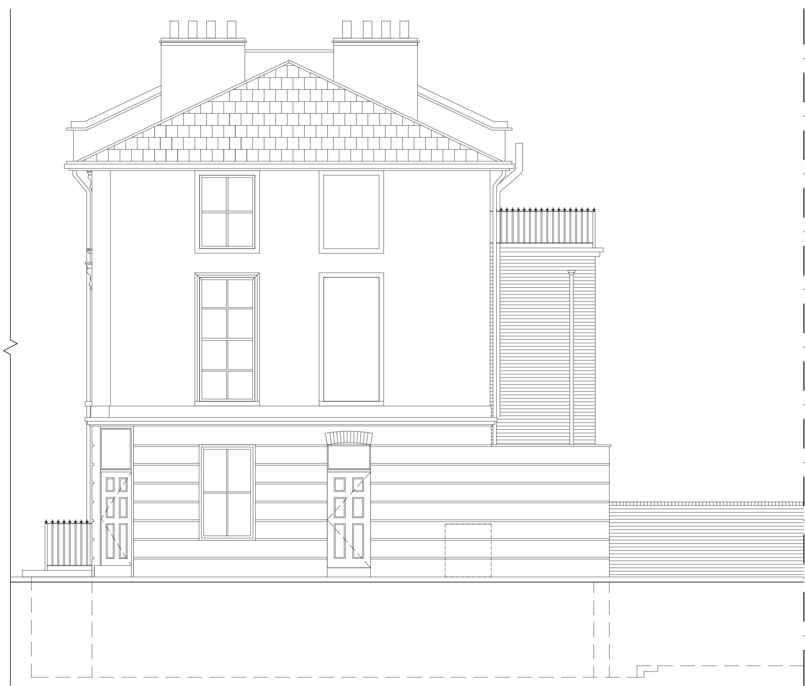
2 SIDE (CHALCOT ROAD) ELEVATION : EXISTING Scale 1:50