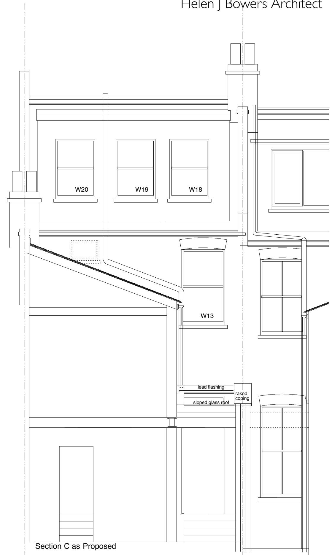
Section C as Proposed

PROJECT REAR GROUND FLOOR EXTENSION to HOUSE at 73 SUMATRA ROAD, LONDON NW6 1PT