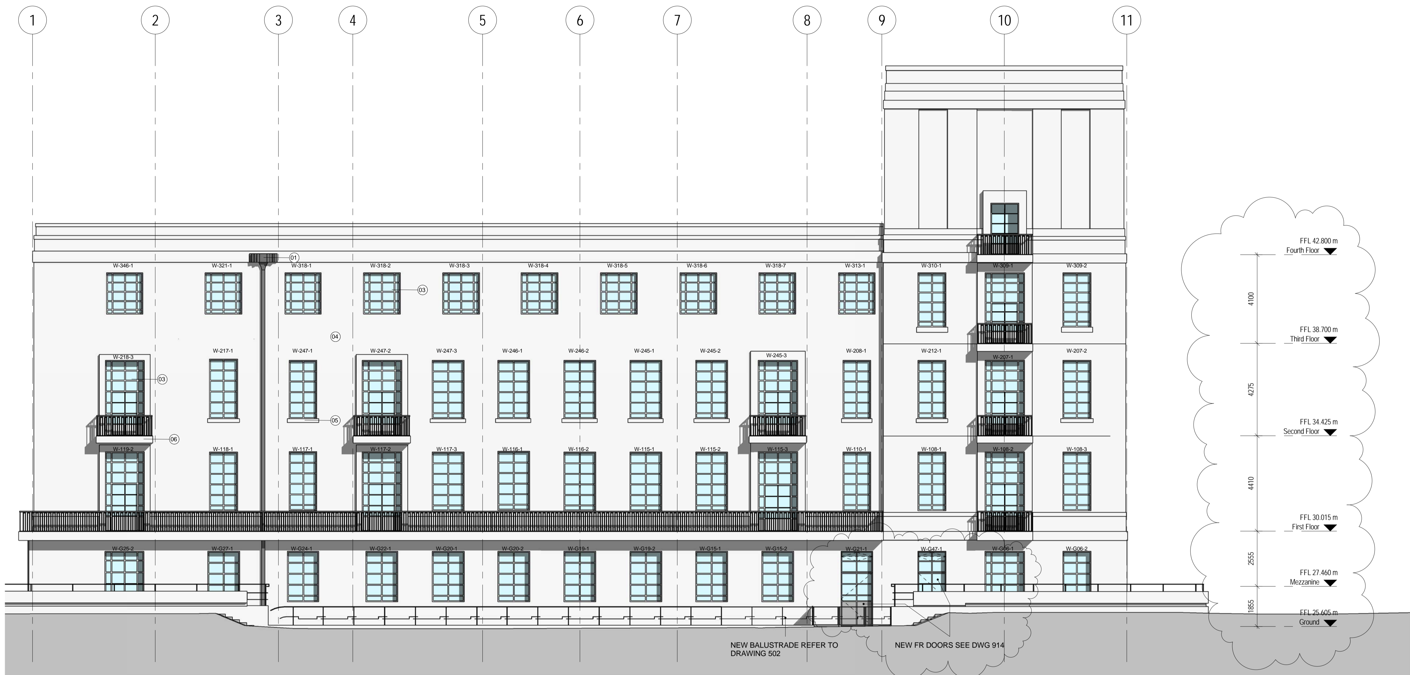
1 PROPOSED ELEVATION WEST 1:100

INFORMATION HANDLING CLASSIFICATION: UNRESTRICTED