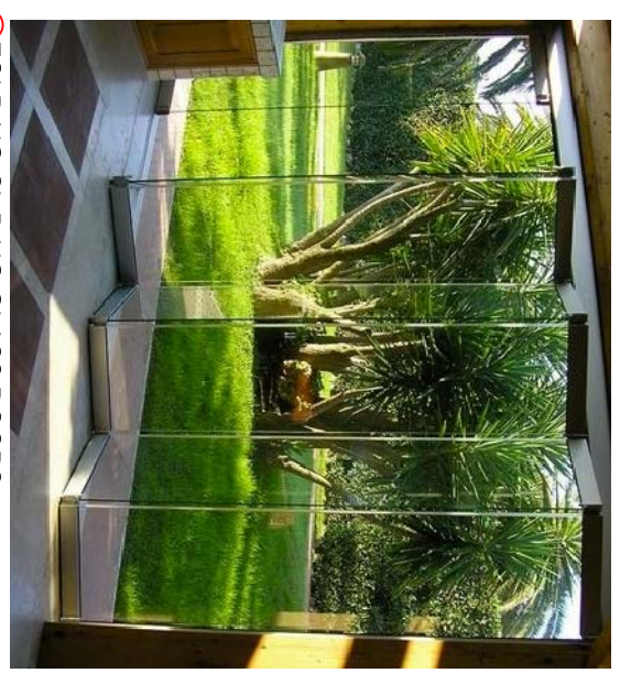
① FOLDING-SLIDING GLASS DOORS / NO FRAME