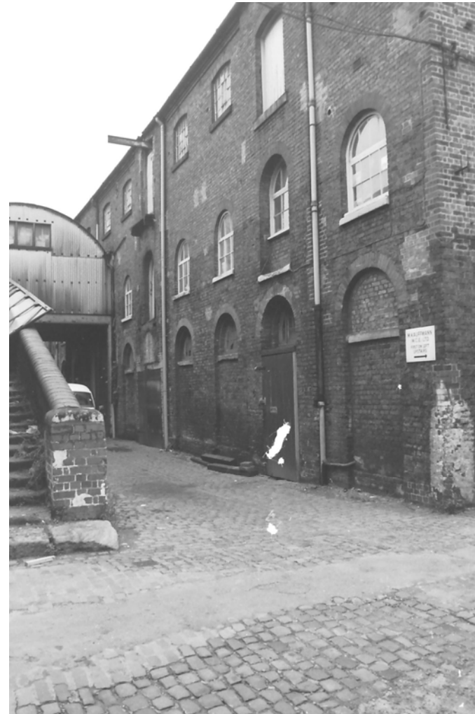
Figure 1 The Provender Store in 1975 (Front page and Pic. 1 by M.T.Tucker).