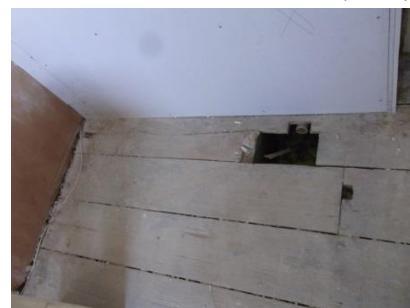
3 rd Floor. Original floorboards beneath plasterboard partition. (Ref 4).