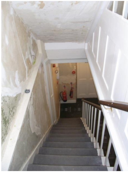
Basement Staircase redecoration. Panelling revealed.