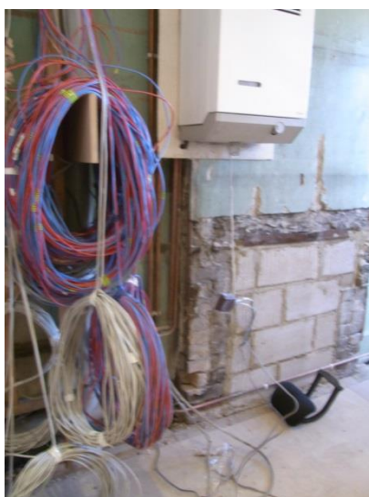
2 nd Floor. Wiring and pipework behind plasterboard false wall. (Ref. 3).