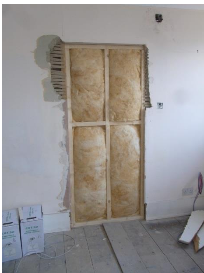
3 rd Floor. Recent opening between small and large front rooms closed off. (Ref. 7).