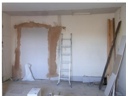
3 rd Floor. Recent opening between large front and rear rooms closed off. (Ref. 6).