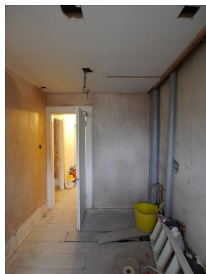
3 rd Floor older plasterboard added around door opening, on top of laths. (Ref.9)