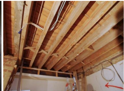
Basement annexe exposing non-original ceiling/floor joists. (Ref. 1)