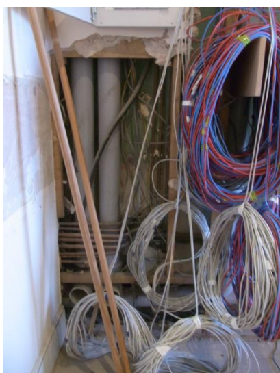
2 nd Floor. Wiring and pipework behind plasterboard false wall. (Ref. 3).