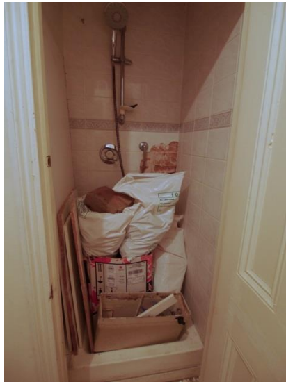
Basement Shower room to be stripped out. (Ref. 2).