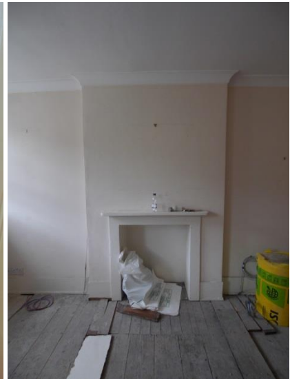
2 nd Floor - recent cornices, original fireplaces and skirtings.