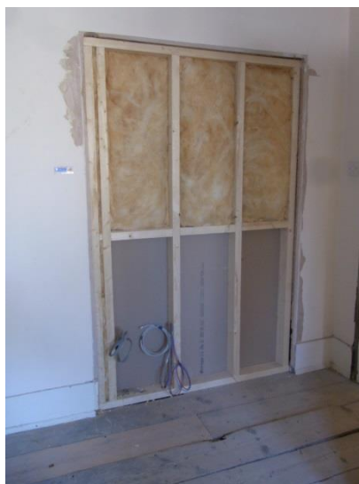
3 rd Floor. Recent opening between large front and rear rooms closed off. (Ref. 6).