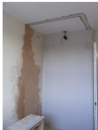
3 rd Floor. Plasterboard partition between rear small room and wc relocated. (Ref. 4).