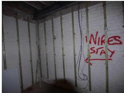
Basement annexe. Plasterboard dry lining.