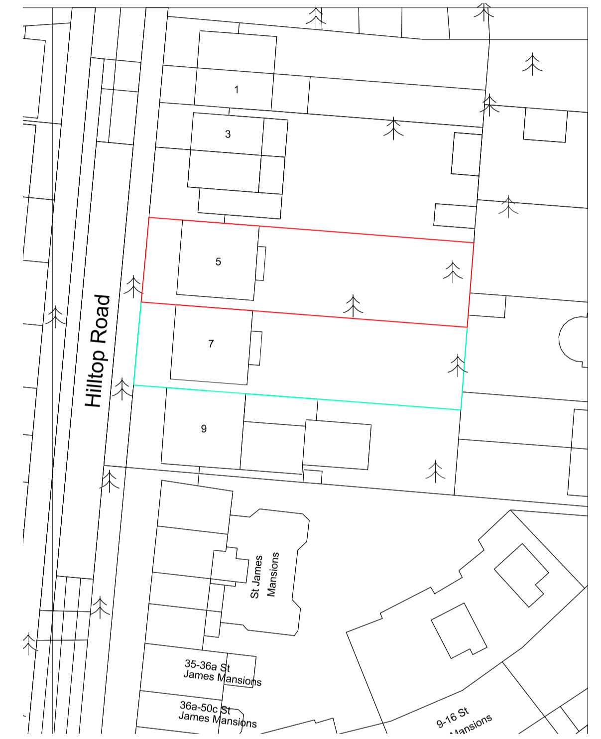
Existing Block Plan 1:500