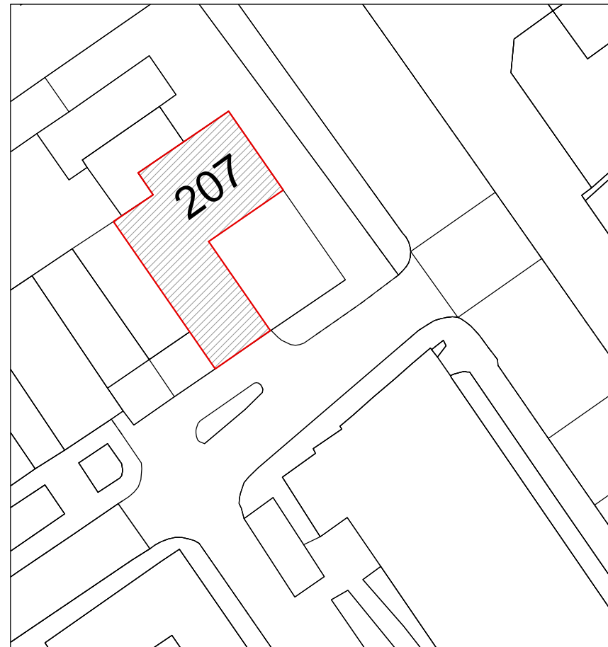
SITE PLAN 0 10 20 30m scale 1:500