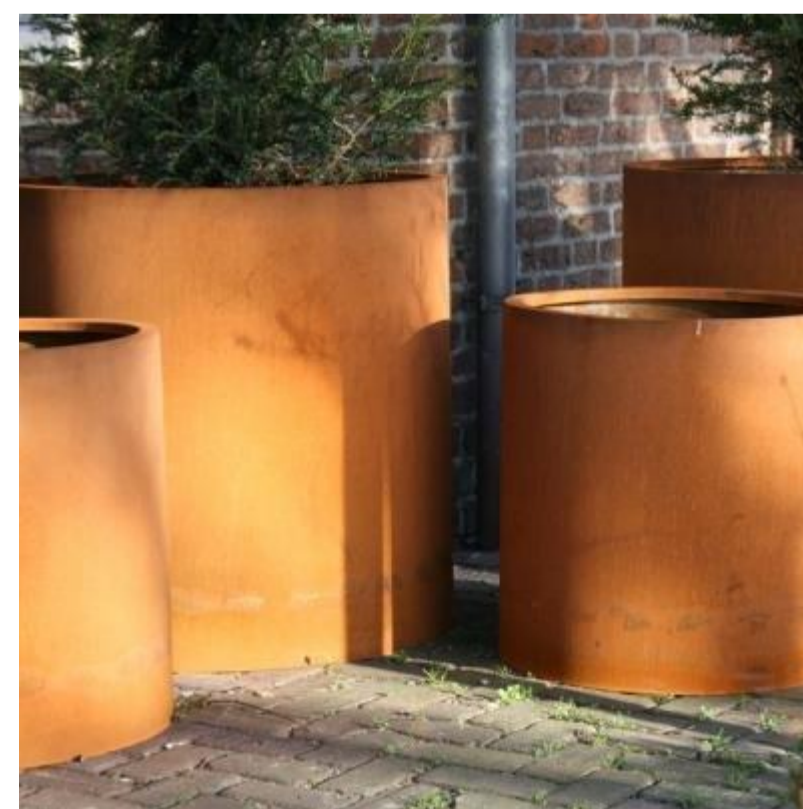
Corten steel planters