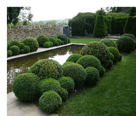
Indicative clipped shrub & container plant