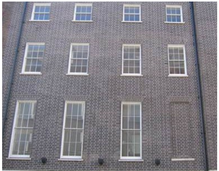
Built example - 32 Baker Street