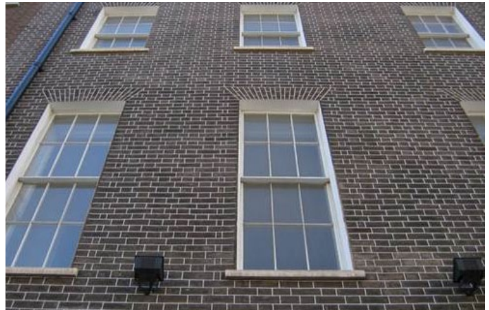
Built example - 32 Baker Street

Note that the construction of the facade using the base brick does not impede end the colour choice as this will be stained.