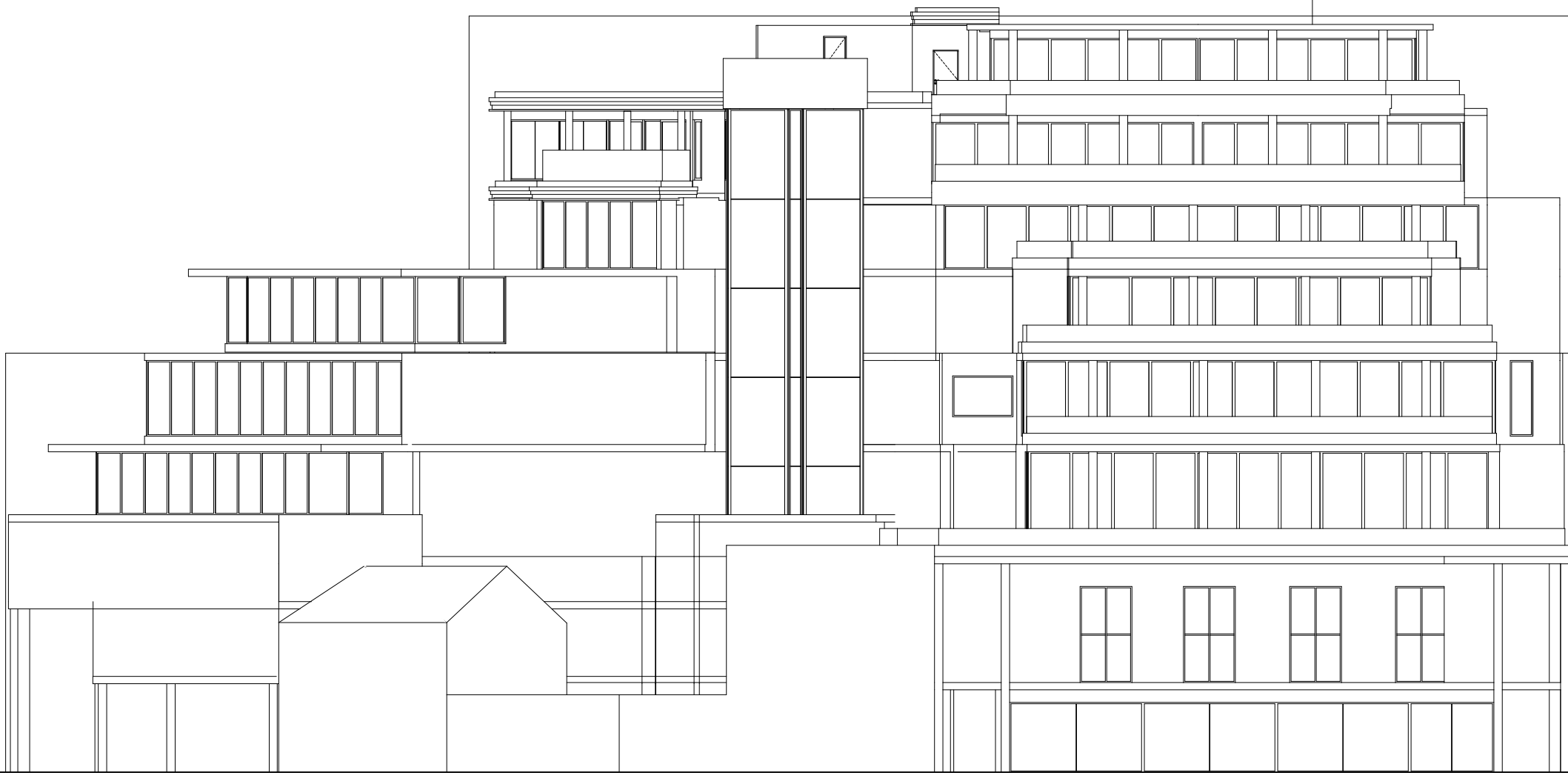
EXISTING POND STREET ELEVATION