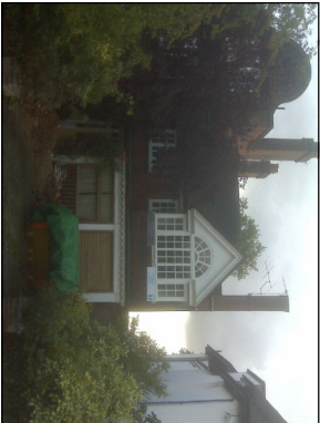
1a Kidderpore Avenue