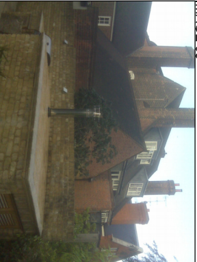
1a Kidderpore Avenue