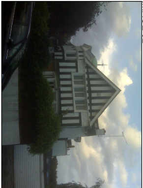
4 Kidderpore Avenue