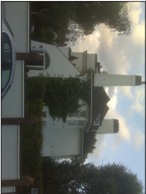
2 Kidderpore Avenue