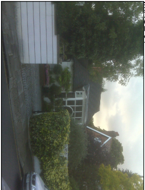
5 Kidderpore Avenue