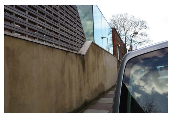
NW3 Glass extension - street elevation