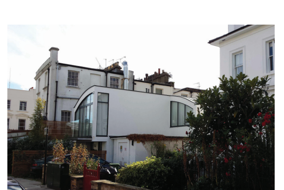
New build - Priory Road