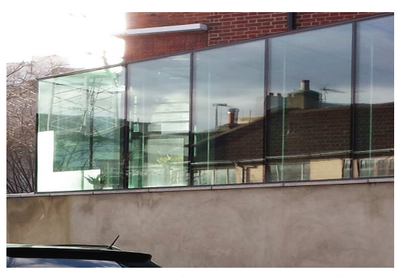
NW3 Glass extension - street elevation