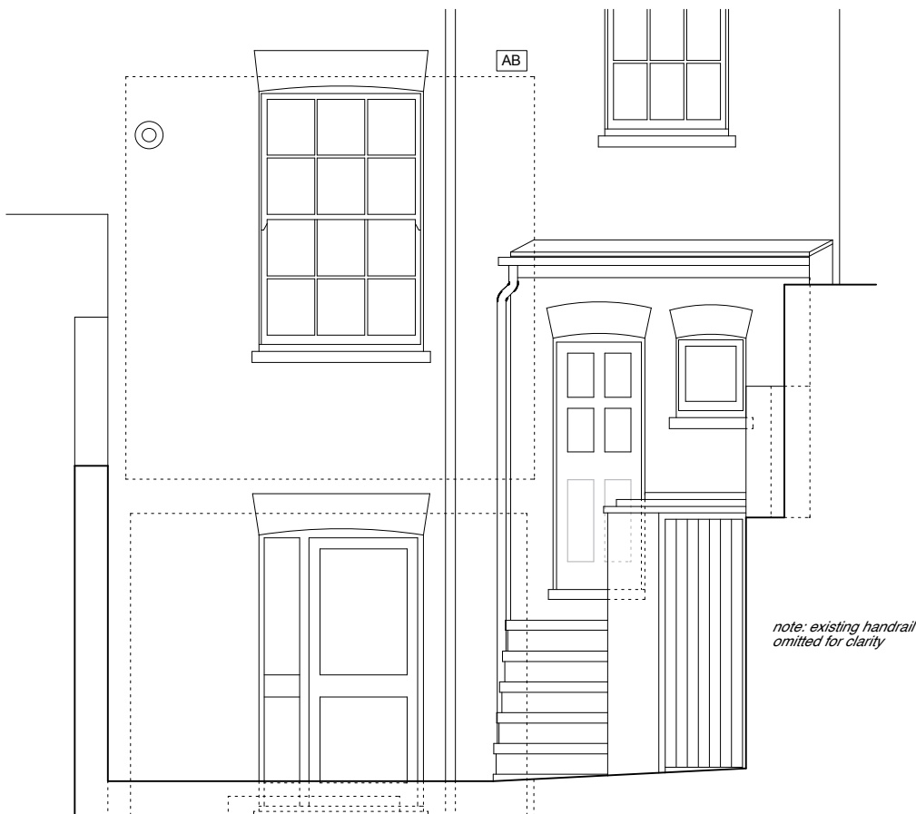
REAR ELEVATION (RAILINGS/BALUSTRADING OMITTED FOR CLARITY)