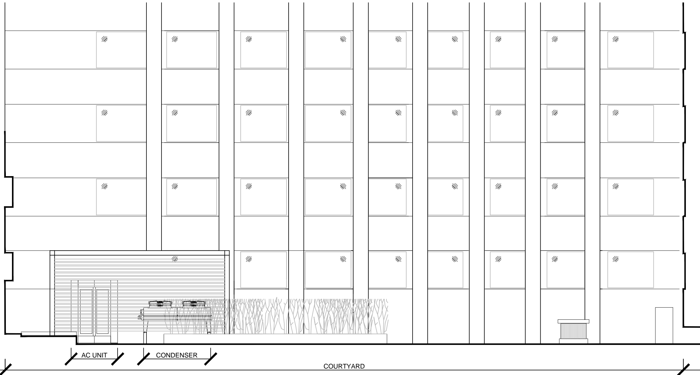
PROPOSED CONDENSER AND AC UNIT SITUATED BEHIND LOUVRED SCREEN

Notes: Do not scale from this drawing. Contractors shall be responsible for the checking of all stated dimensions, with any anomalies being identified to the originator prior to any construction or fabrication works commencing.