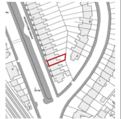
SITE PLAN - 1:1250 @ A1

DRAWING ILLUSTRATES DESIGN INTENT ONLY. CONTRACTOR TO PRODUCE SHOP DRAWINGS FOR DESIGNER APPROVAL IF REQUIRED. CONSTRUCTION ISSUE DRAWINGS MUST BE CONTRACTOR'S OWN.