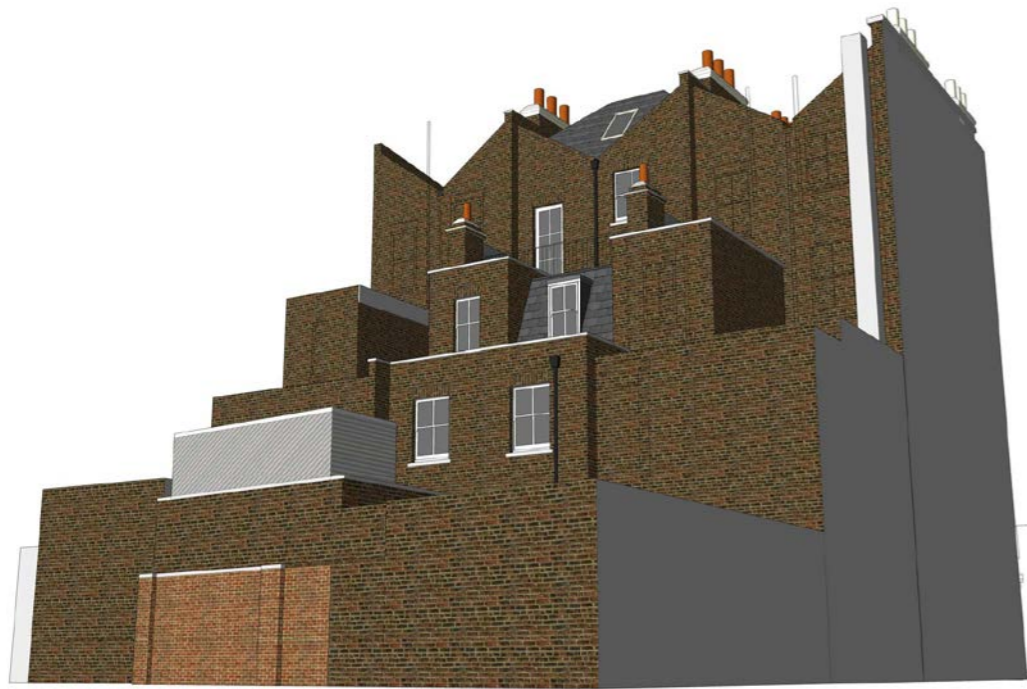
3D VIEW OF PROPOSED REAR ELEVATION