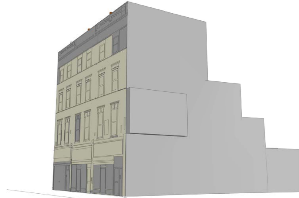
3D EYE LEVEL VIEW OF FRONT ELEVATION FROM OPPOSITE SIDE OF KILBURN HIGH ROAD TO SHOW THAT PROPOSED FOURTH EXTENSION WILL NOT BE VISIBLE