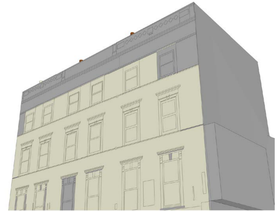
3D EYE LEVEL VIEW OF FRONT ELEVATION FROM OPPOSITE SIDE OF KILBURN HIGH ROAD TO SHOW THAT PROPOSED FOURTH EXTENSION WILL NOT BE VISIBLE