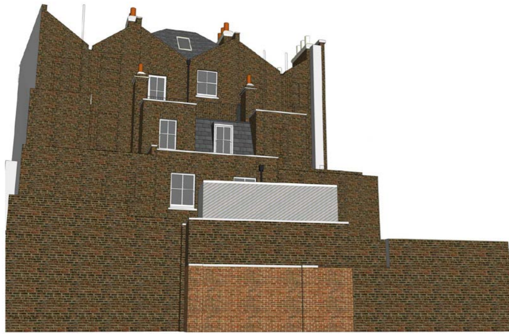
3D VIEW OF PROPOSED REAR ELEVATION