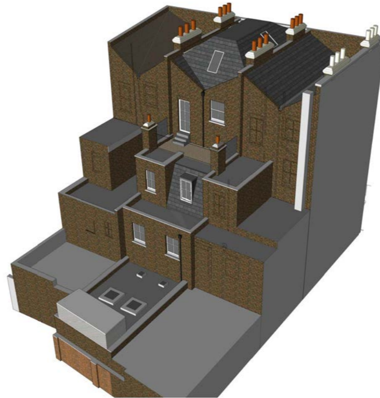
3D VIEW OF PROPOSED REAR ELEVATION