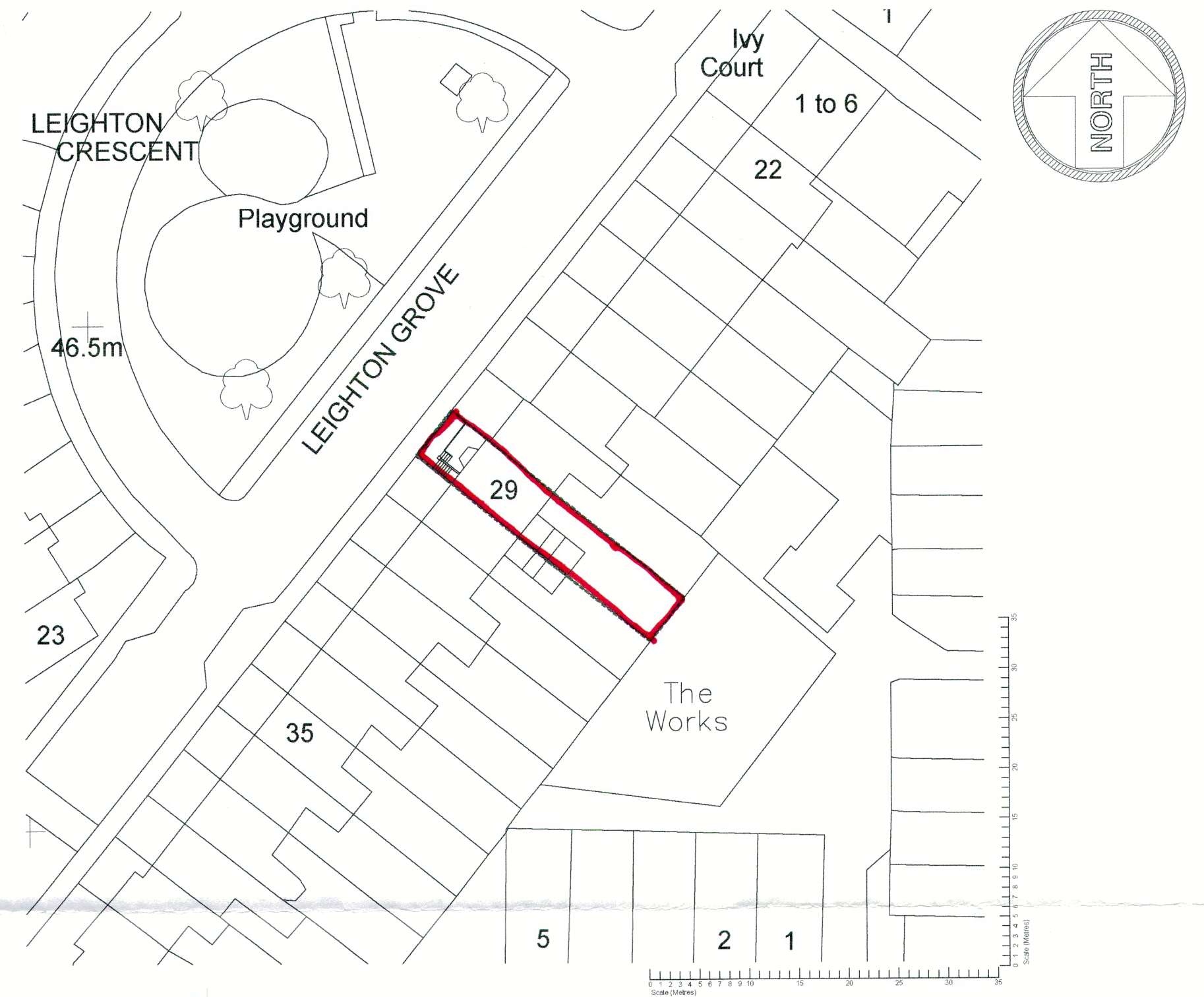
Existing Block Plan (1:500)