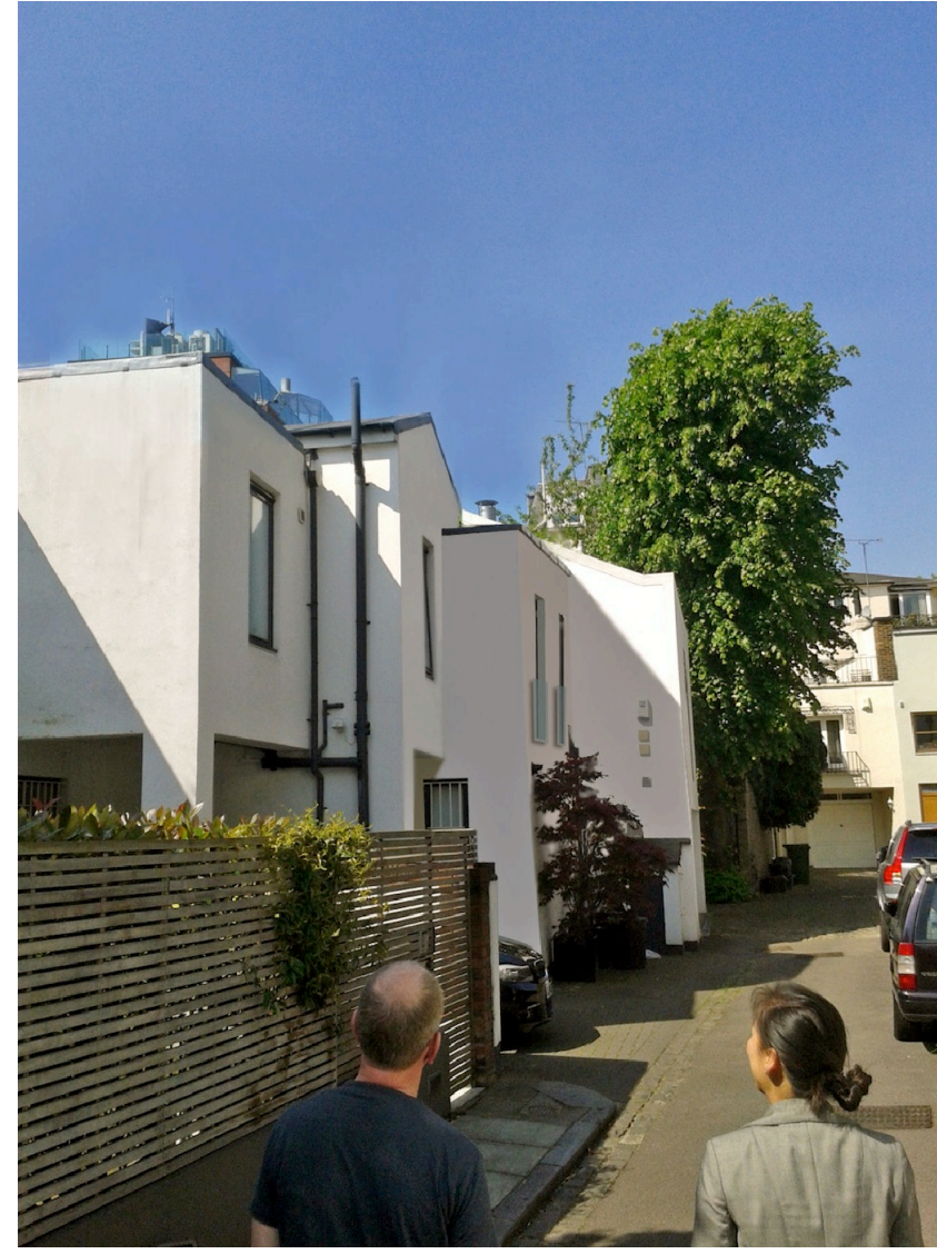
VIEW A PROPOSED VIEW Photomontage for notional scale purpose only.