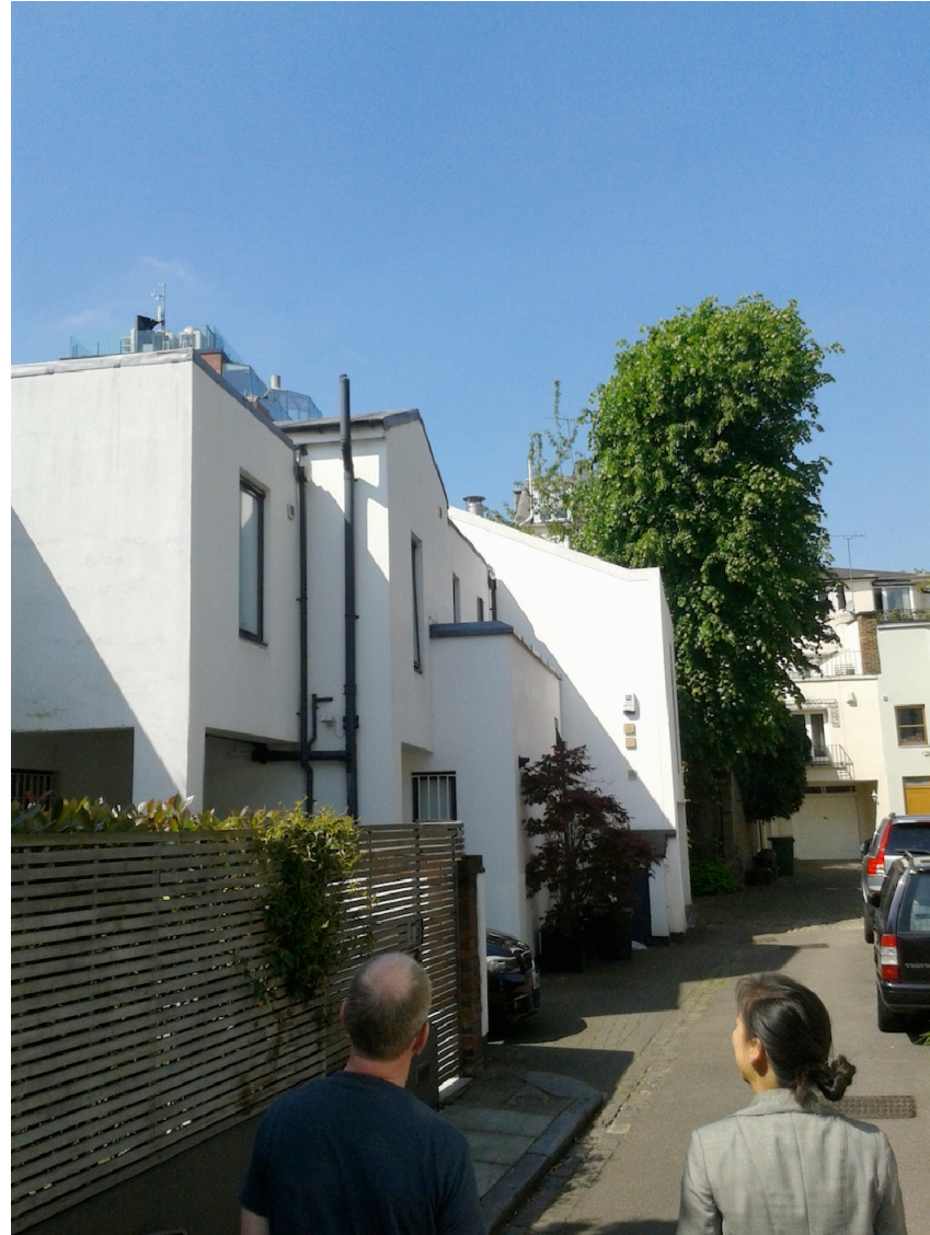
VIEW A EXISTING VIEW