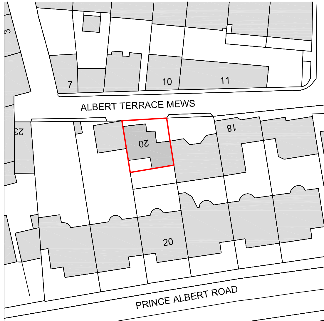
BLOCK PLAN scale 1:500