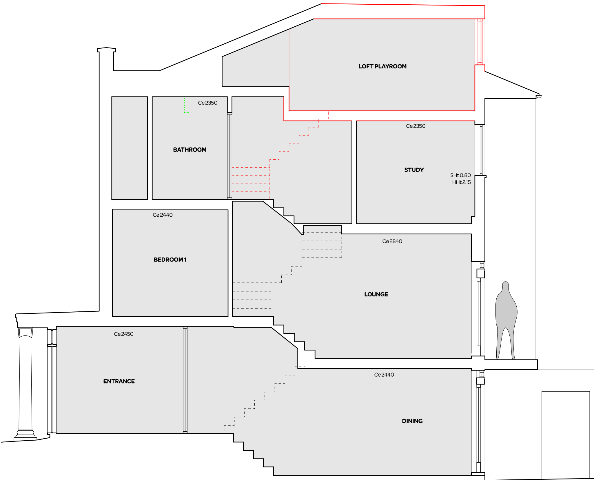
PROPOSED SECTION AA