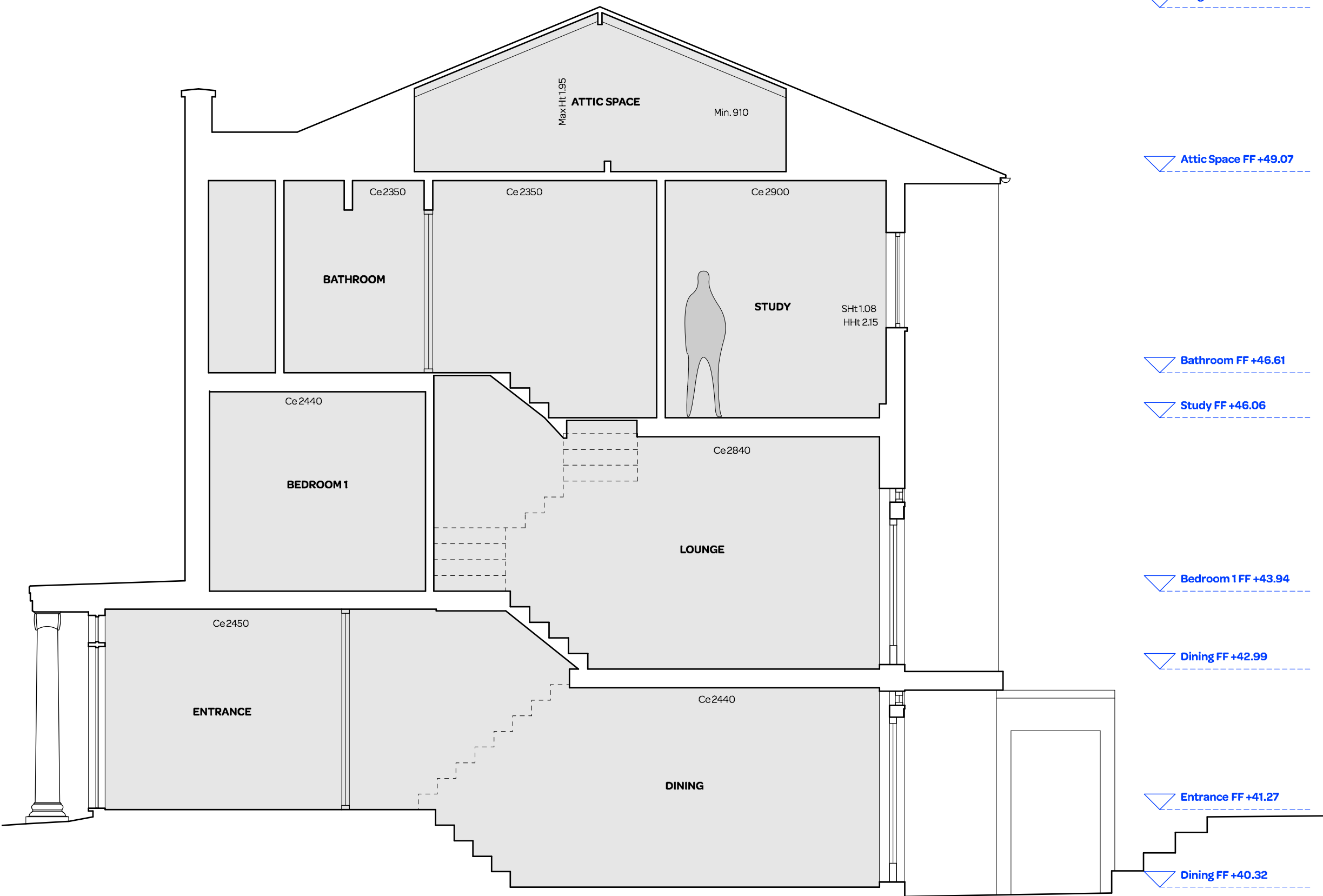
EXISTING SECTION AA