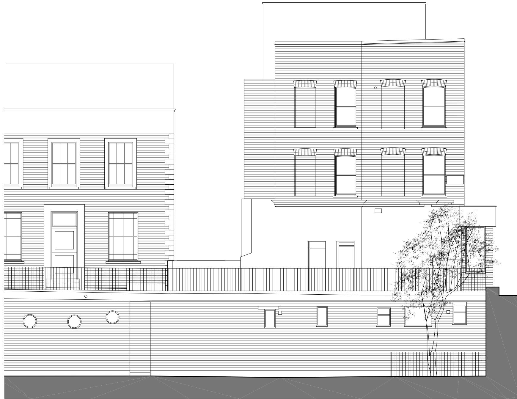
01 Elevation 3 - Lyme Terrace