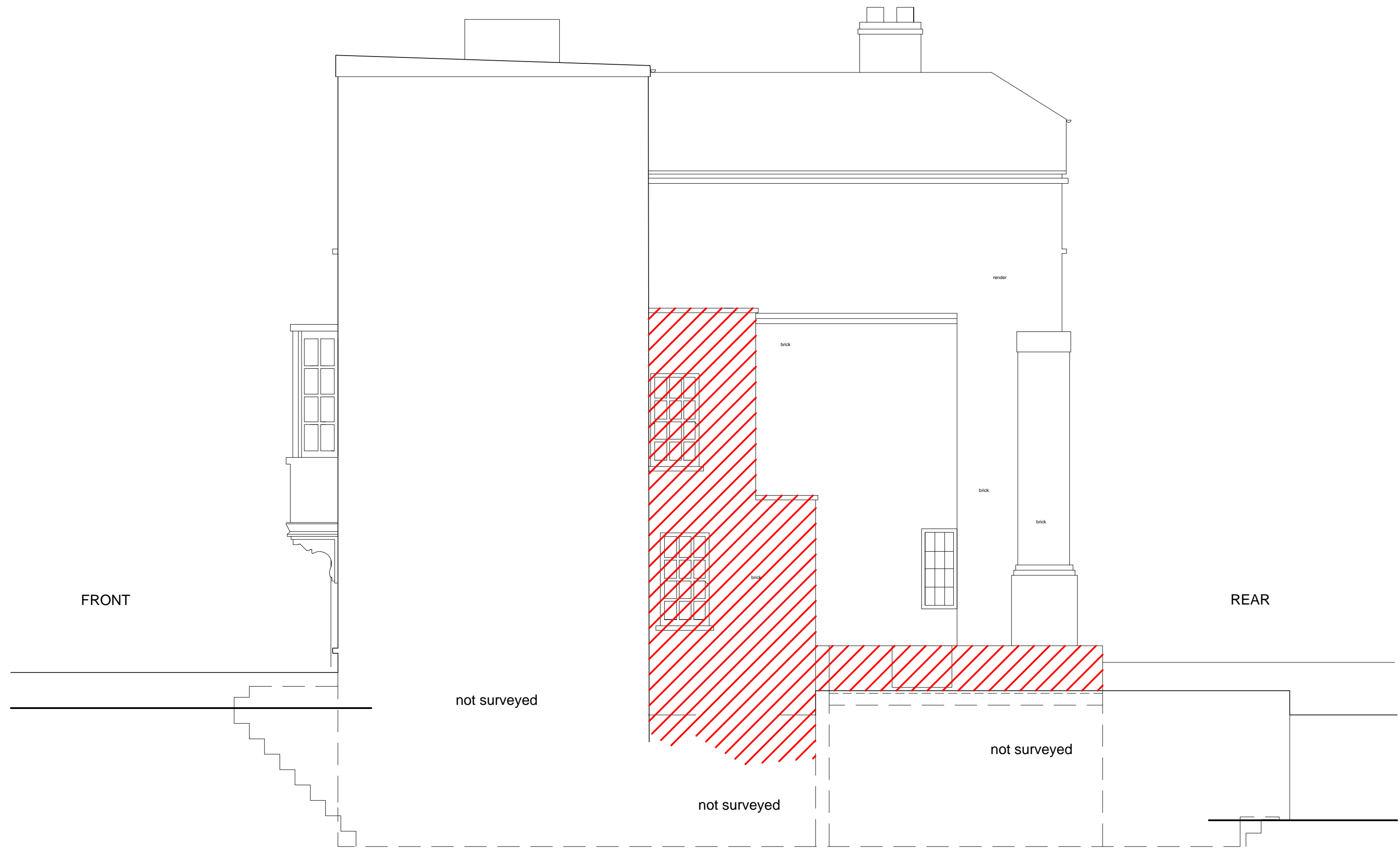
SIDE ELEVATION as existing