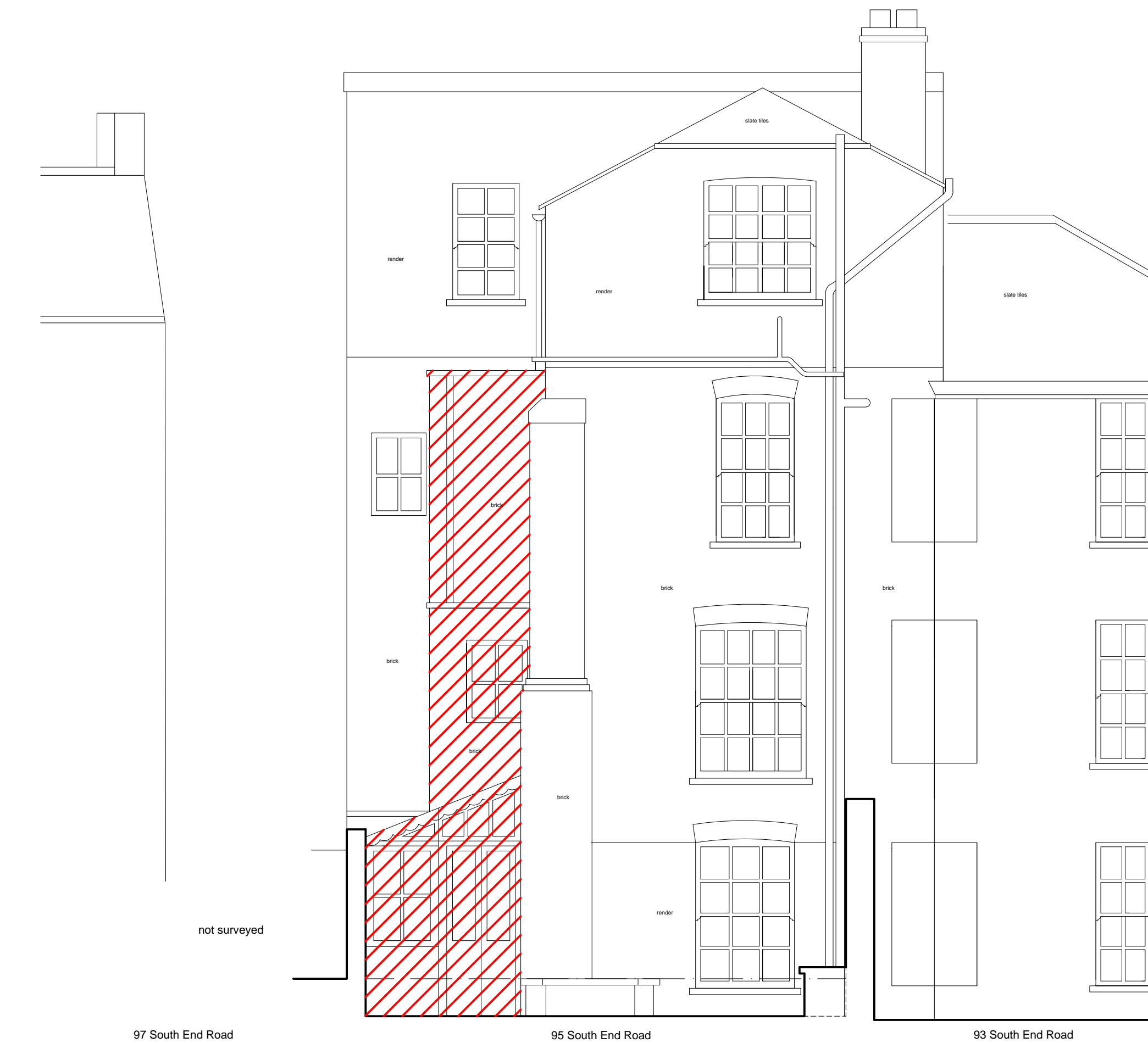
REAR ELEVATION as existing