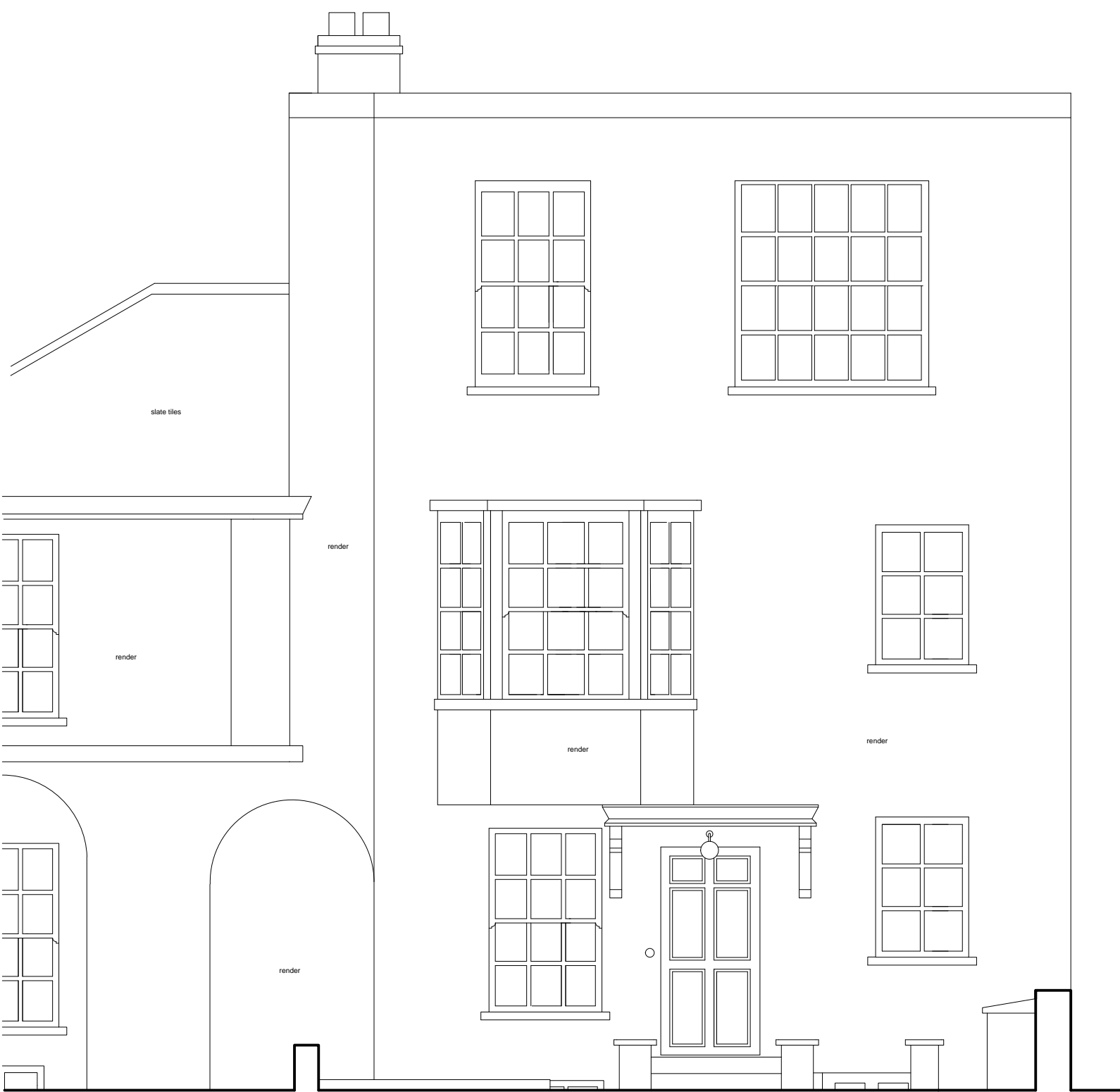
FRONT ELEVATION as existing