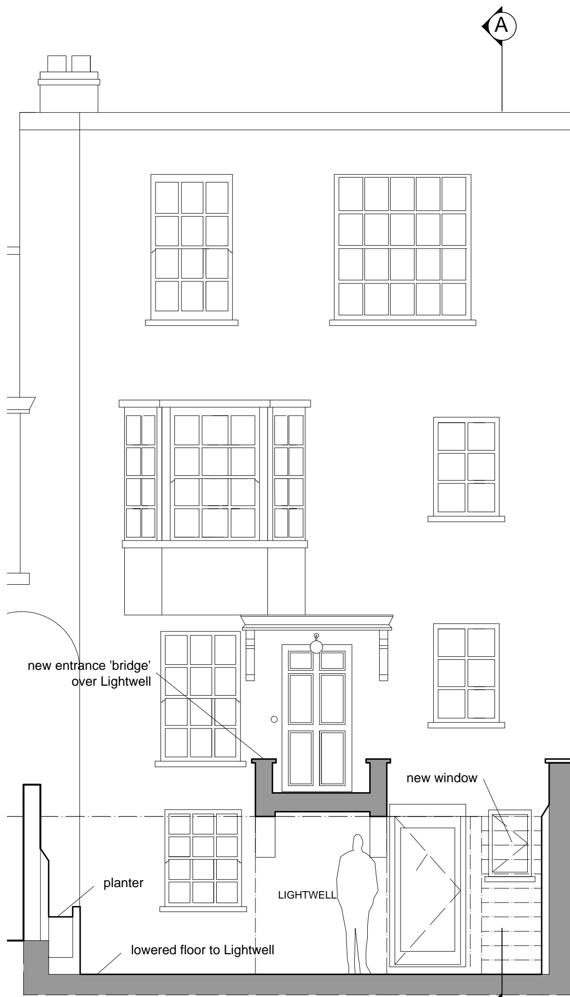
PROPOSED SECTION BB