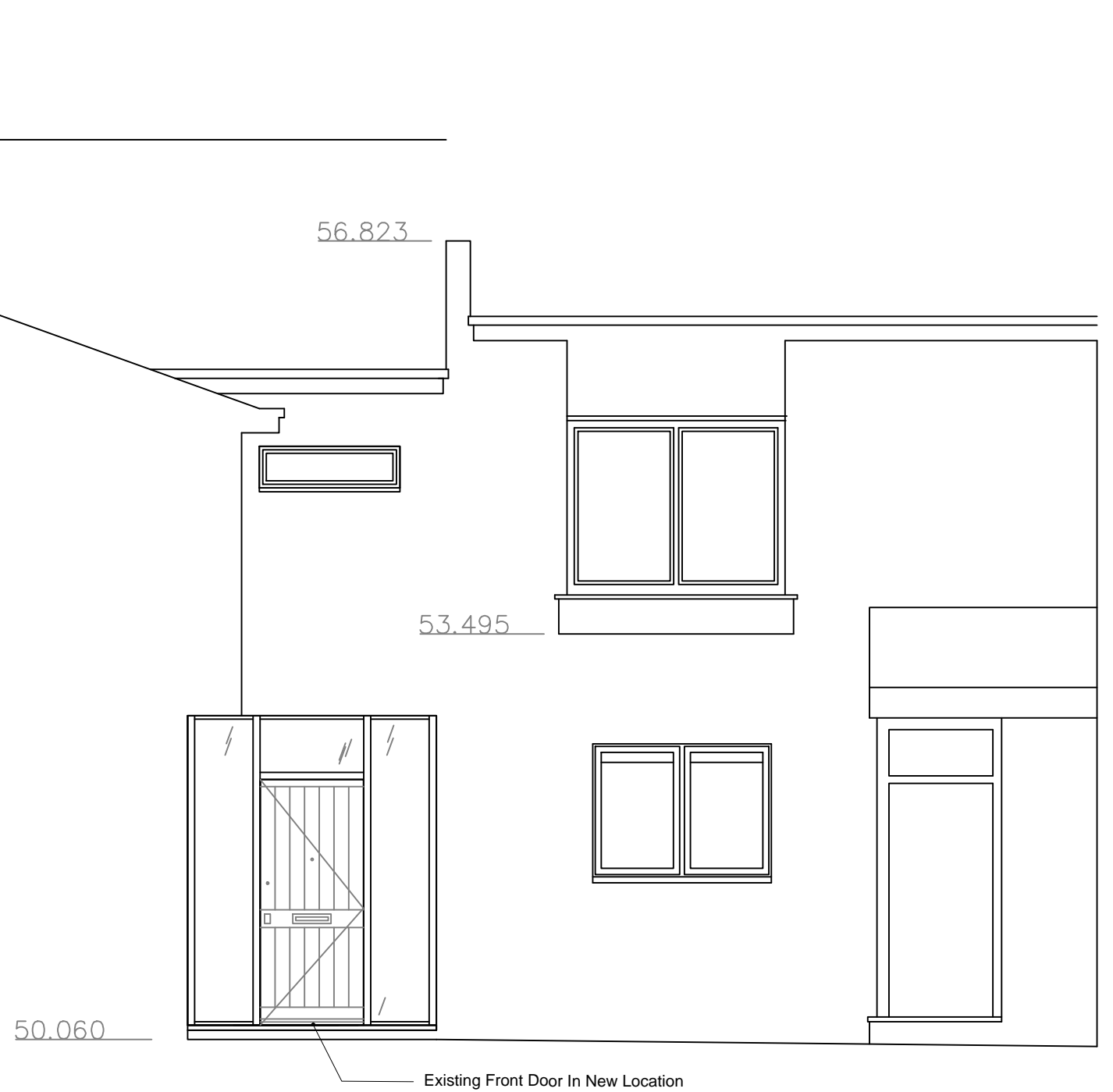
Proposed Elevation: Scale 1:50@A3