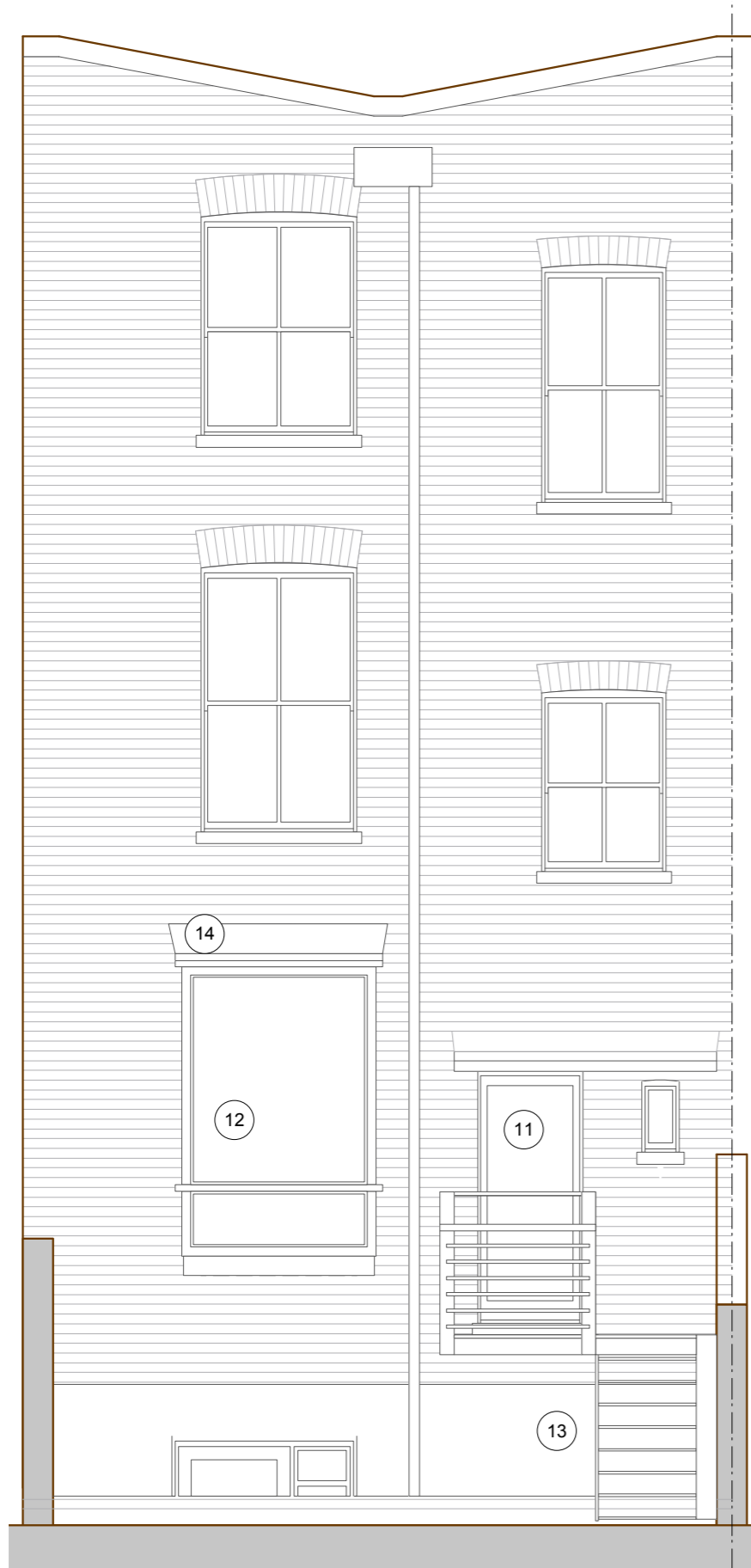
proposed rear elevation PE