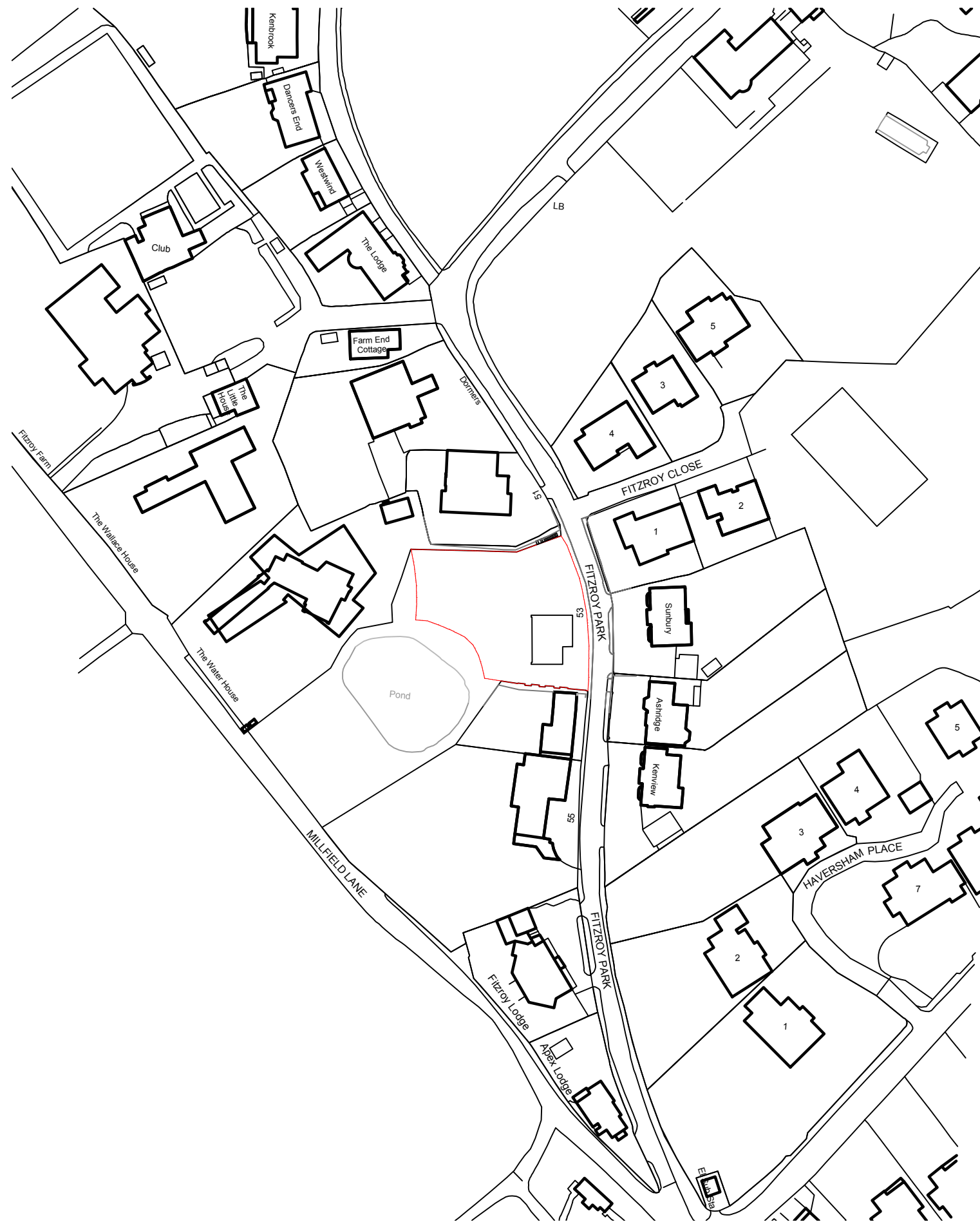
Location Plan 1:1250 (A3)