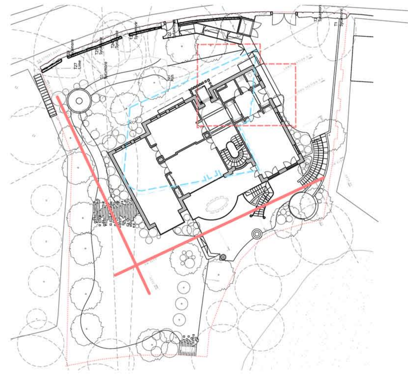
KEY PLAN 1:250 AT A1 1:500 AT A2

Existing outline ——— Approved outline ———