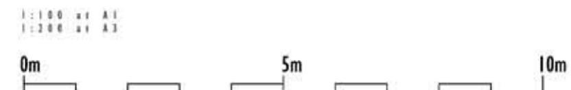
PROPOSED: REAR AND SIDE ELEVATION