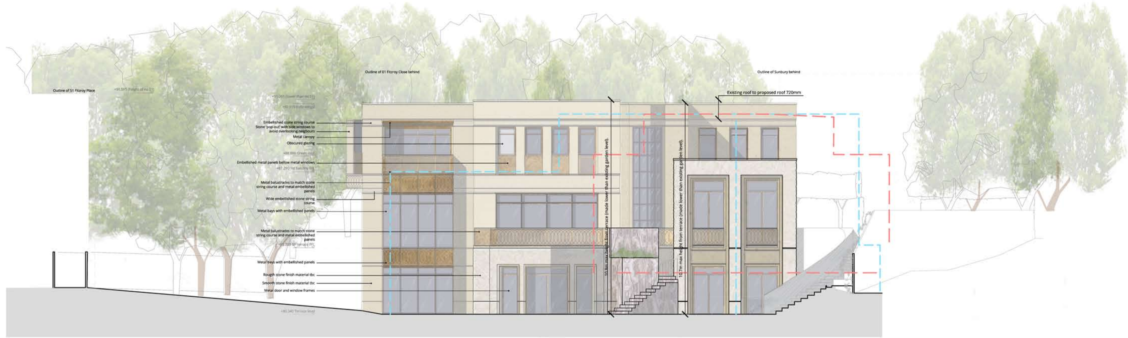
PROPOSED: REAR (WEST) ELEVATION