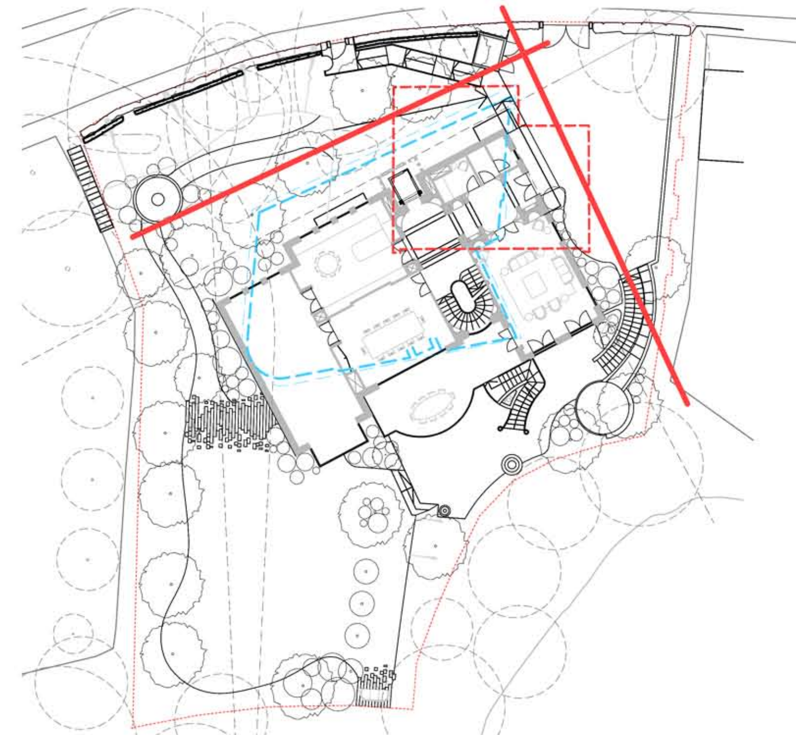
KEY PLAN 1:100 AT A1 1:100 AT A1

Existing outline --- Approved outline ---