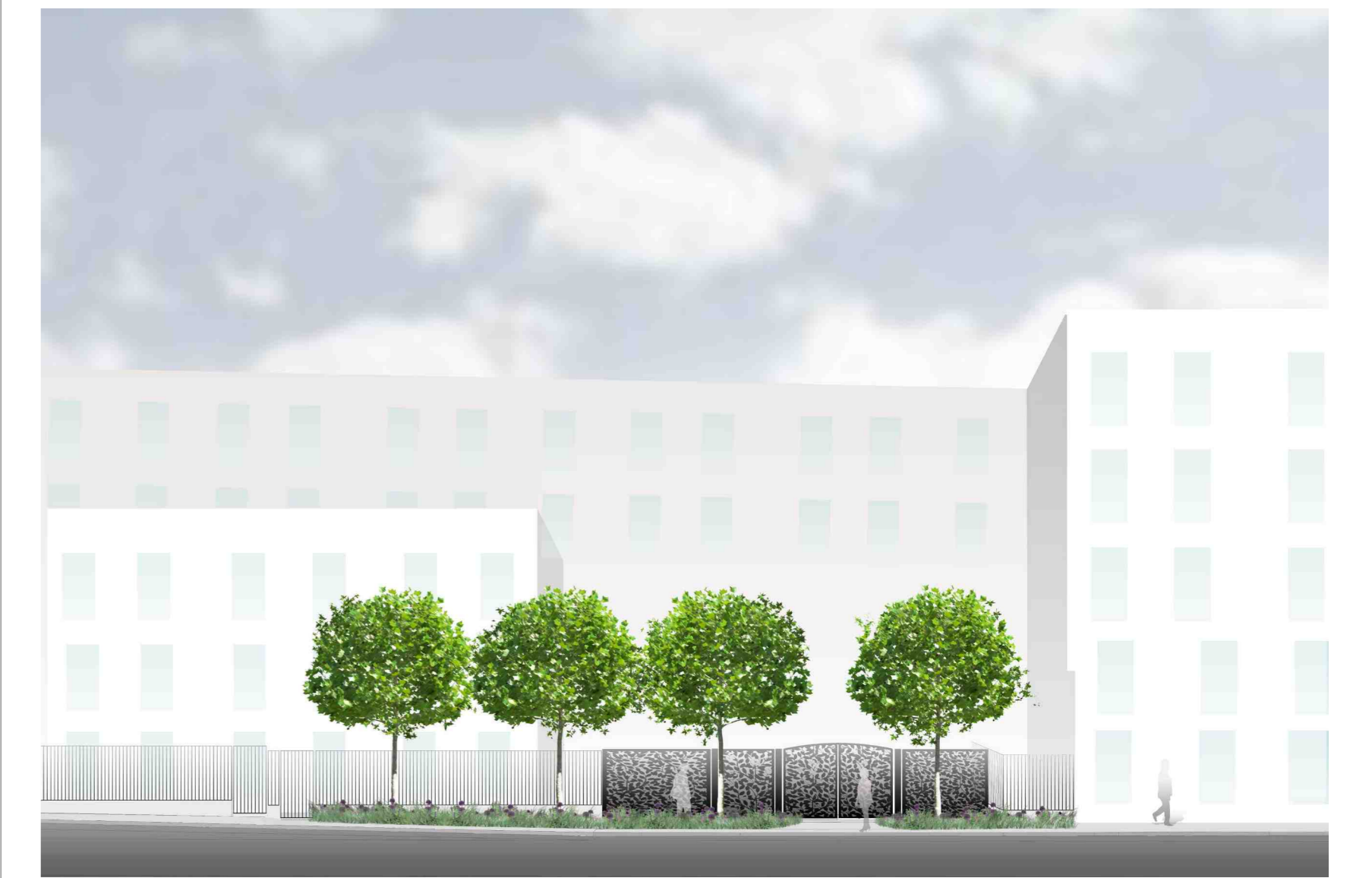
Platanus x hispanica in front of Bespoke Artwork Entrance Gates - Final gate design to be confirmed