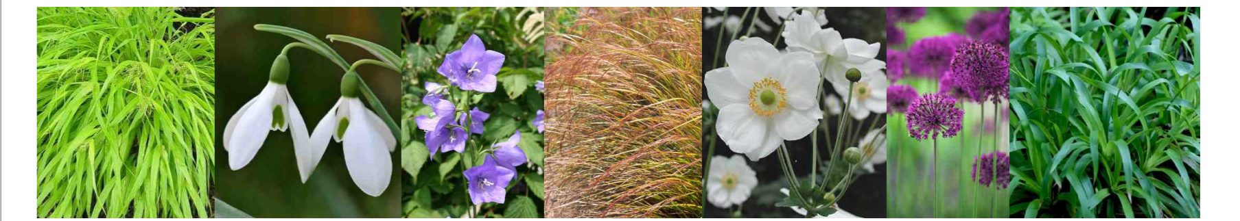
Under planting includes low maintenance evergreen ornamental grasses and herbaceous plants with Allium bulb planting for interest as groundcover becomes established