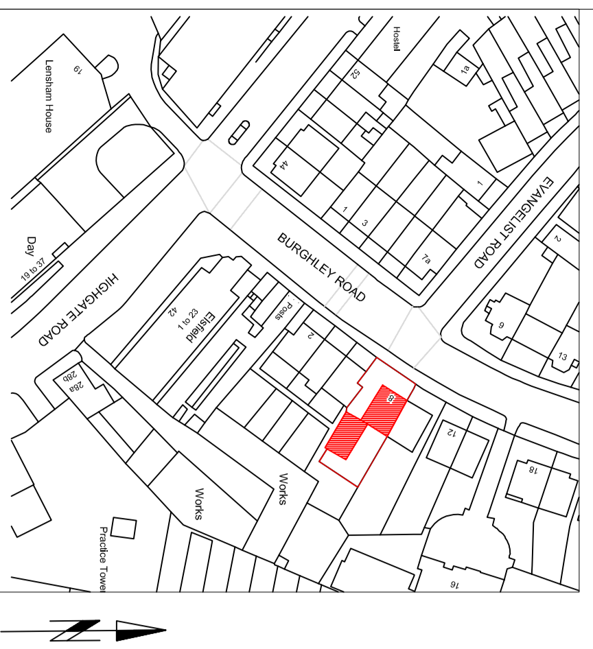
Location Plan (1:1250)