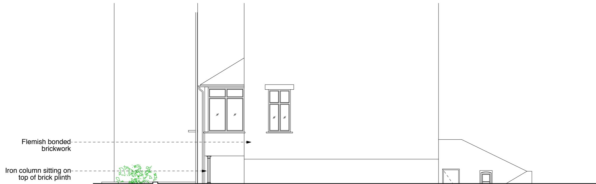
As Existing Side Elevation

(_): Issued for Planning (15.01.15/AL) Revision: Information (date/drawn by)