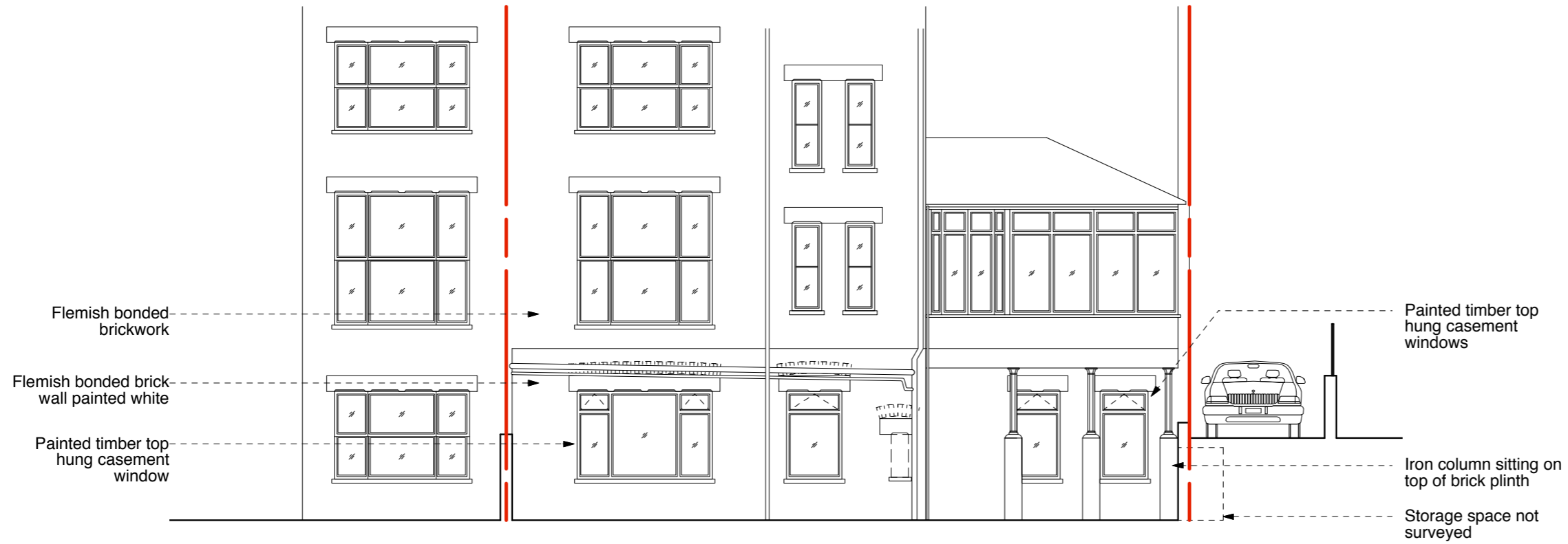
As Existing Rear Elevation

Issue Status SK Information F Feasibility D Design P Permissions S Scheme T Tender C Construction E Existing Condition