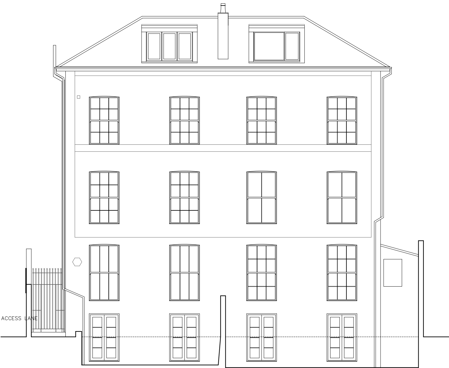
NO.1 BRIDGE APPROACH