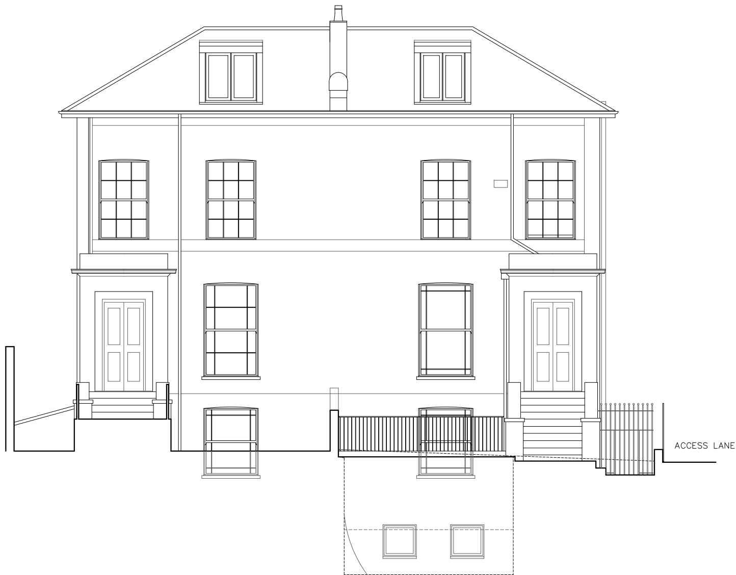
NO.2 BRIDGE APPROACH