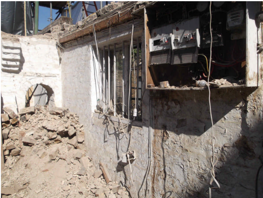
Internal walls (following partial brick collapse).