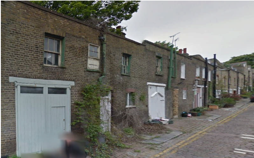
Front elevation (prior to commencement of works)